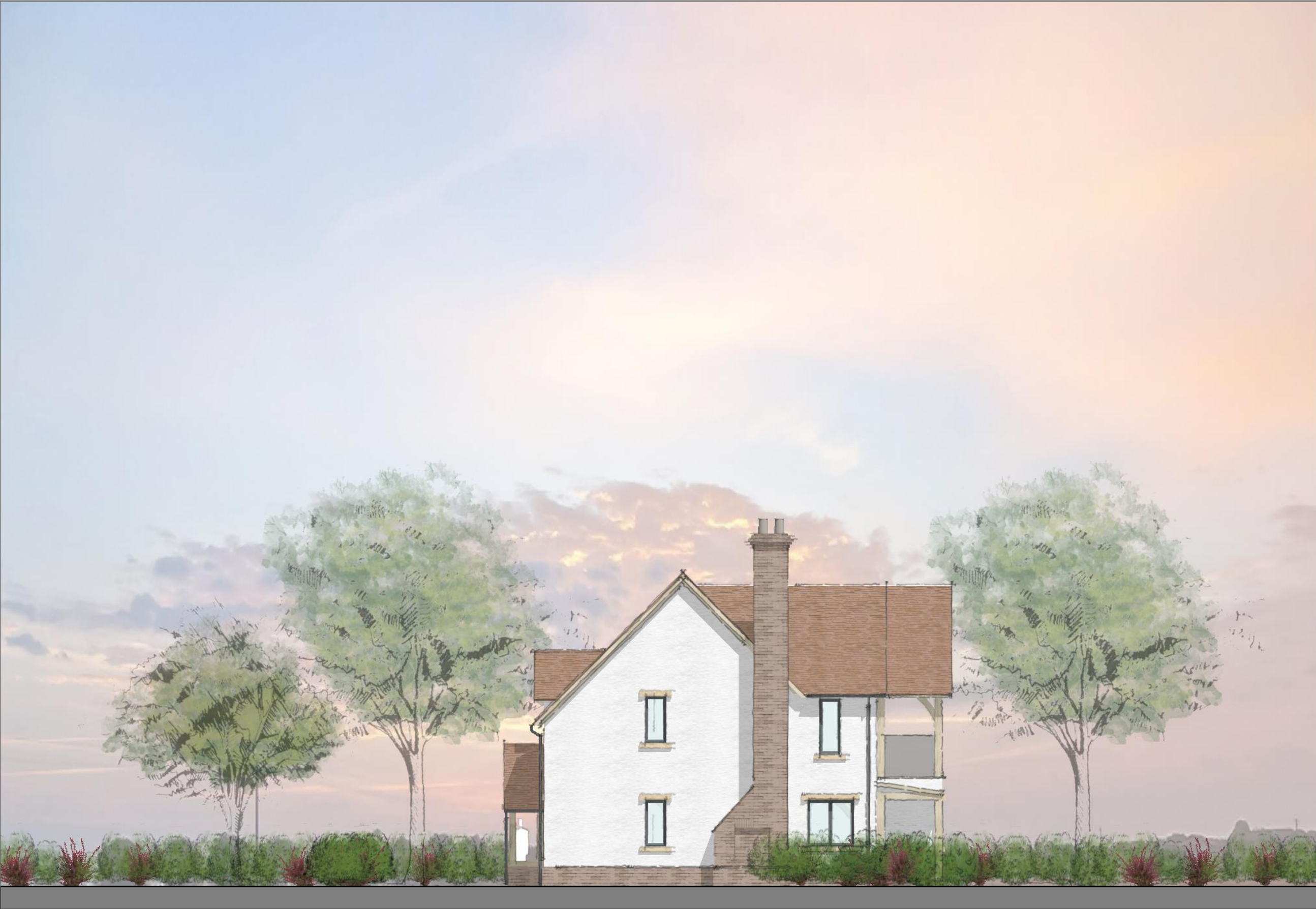
SIDE ELEVATION R Scale 1:100