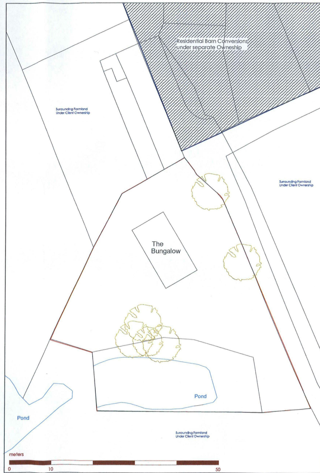
Existing Site Block Plan 1:500