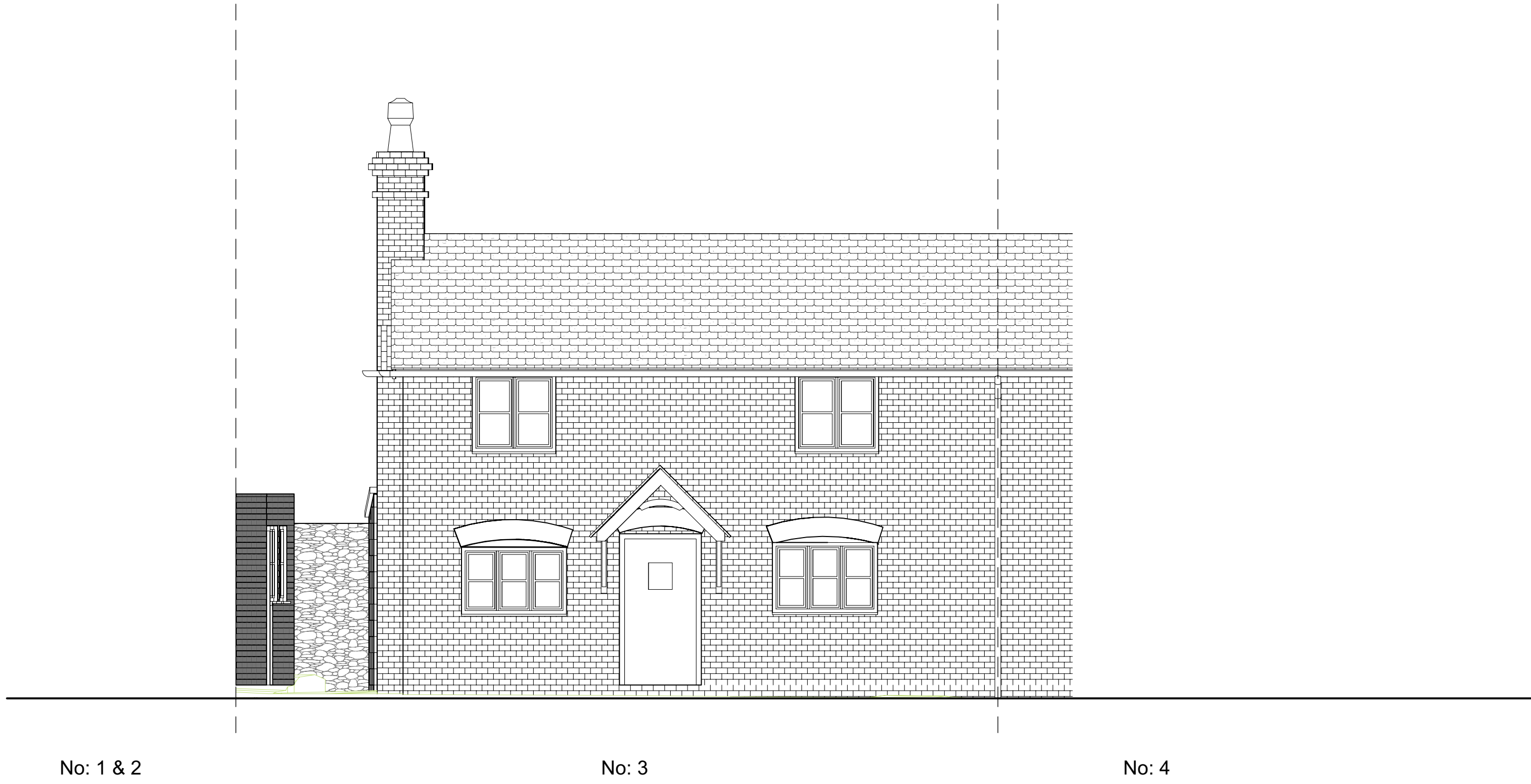
1 Existing South Elevation Scale: 1:50