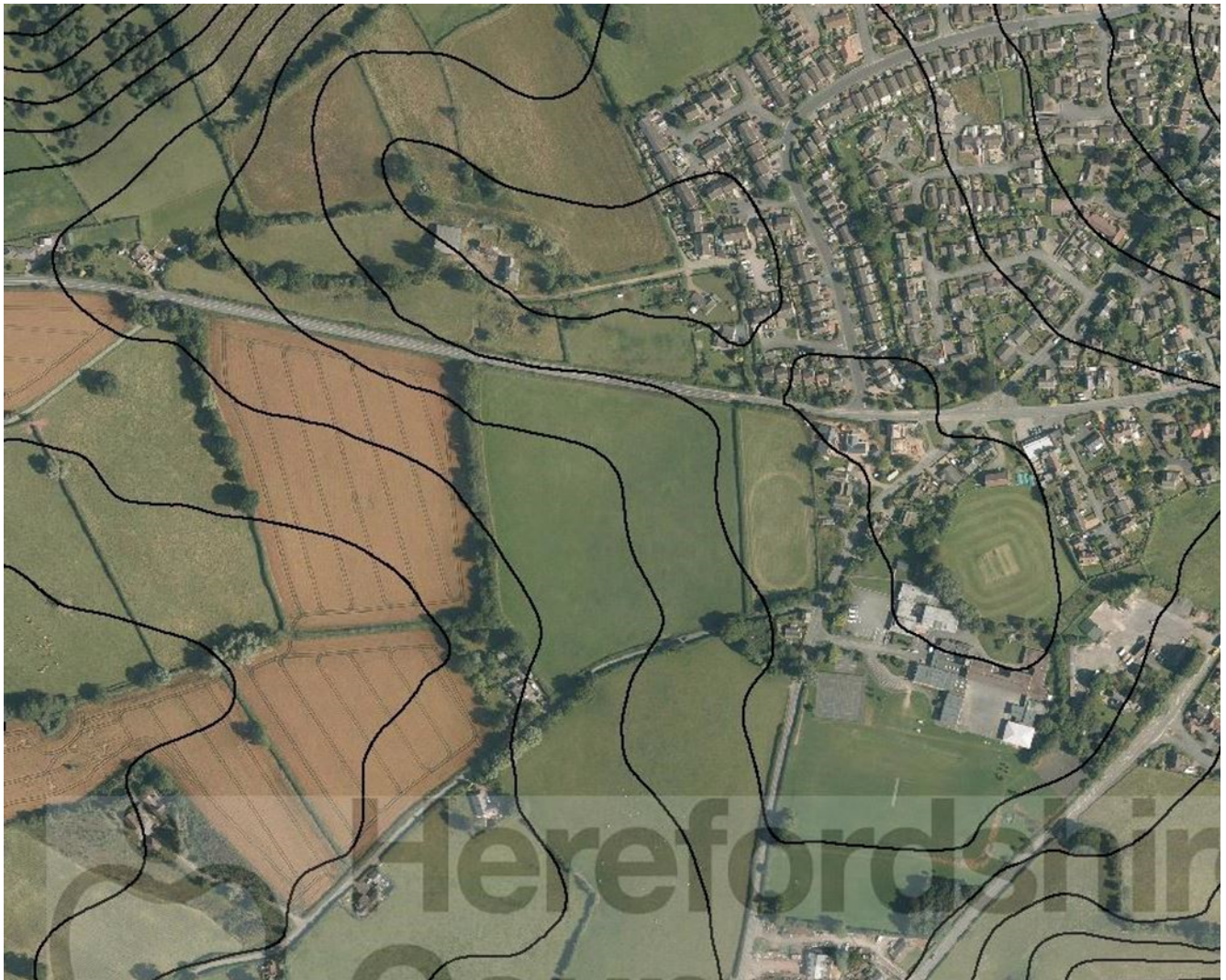
Figure 1: A recent aerial photograph of the site and context with 5m contours