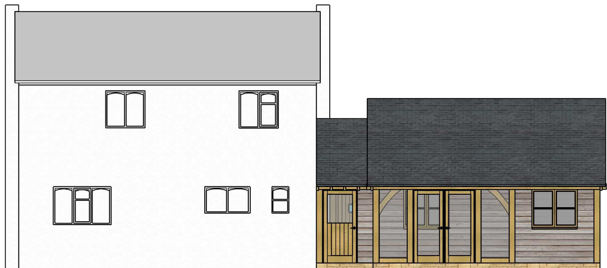
North East (Rear) Elevation