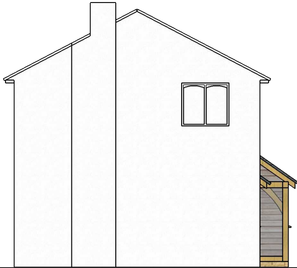
South East (Right) Elevation