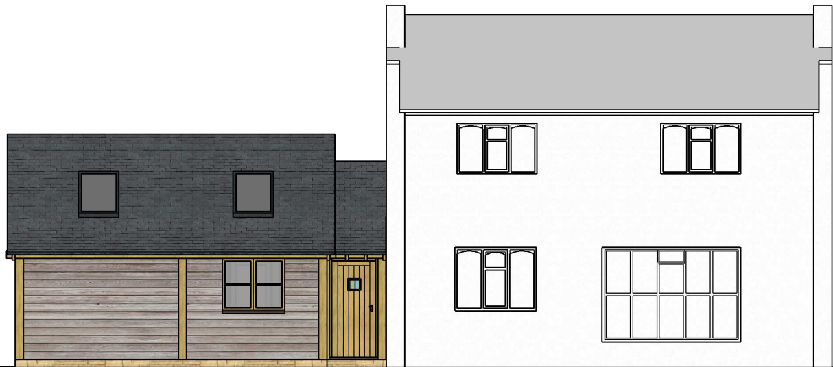
South West (Front) Elevation