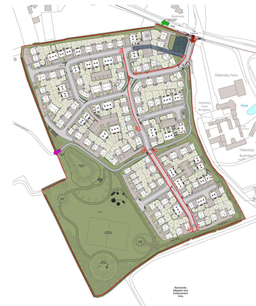
Street Scene Location Plan