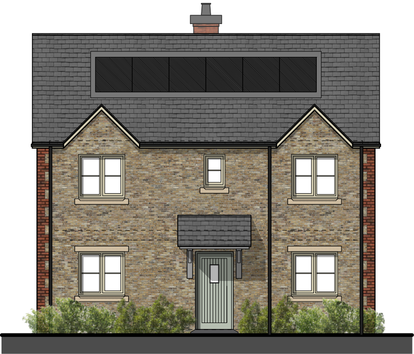
Front Elevation Plot 1

Proposed Elevations Plots 1 & 2 Milne, Potter