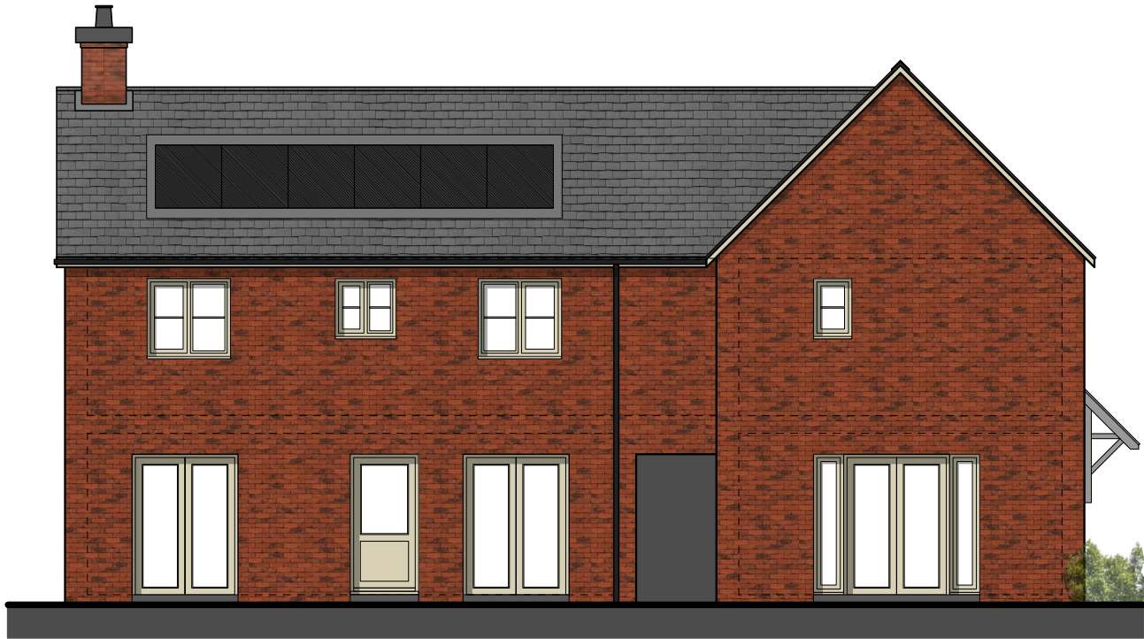
Rear Elevation Plot 2