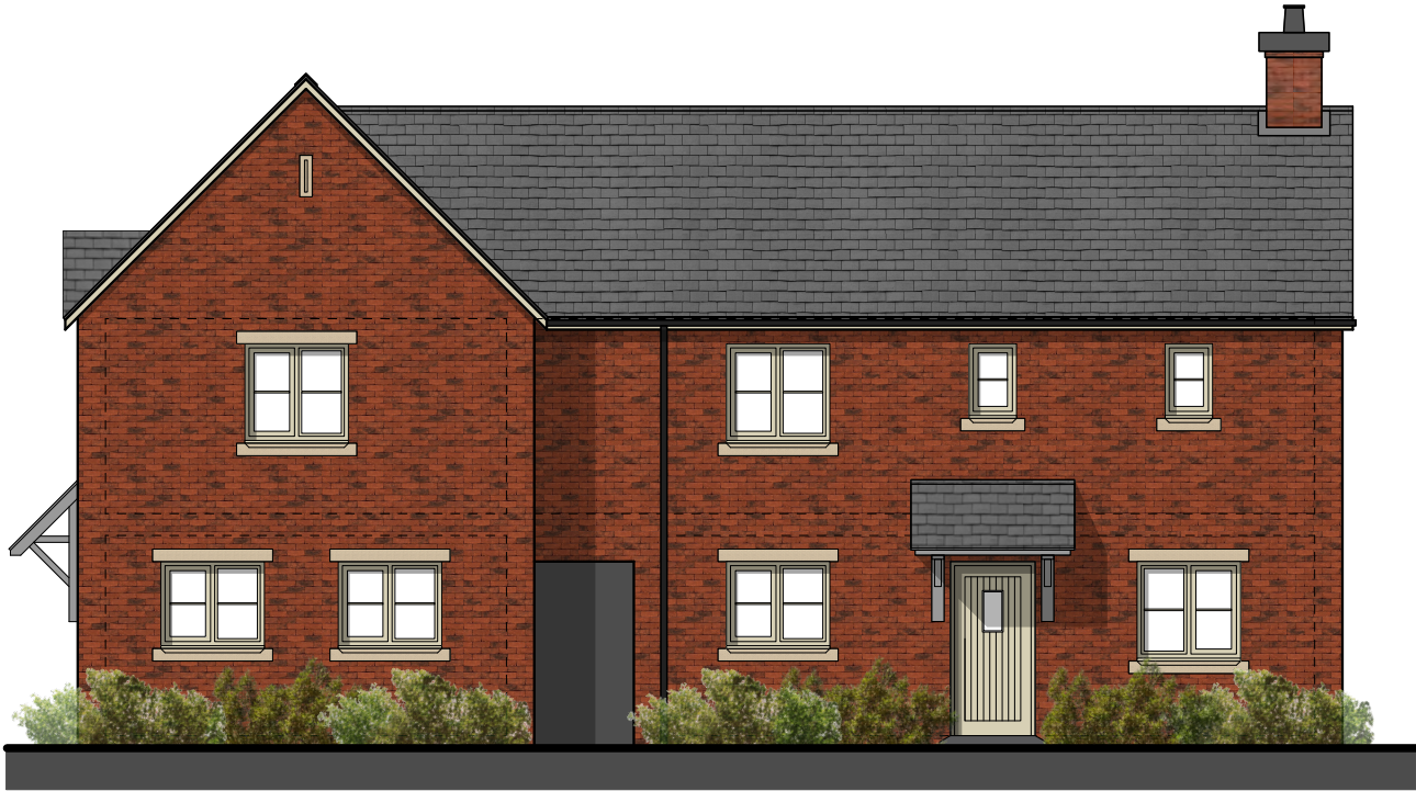
Side Elevation Plot 1

REVISIONS REV: DATE - DRAWN - CHECKED: NOTES -: 20.06.23 - LM - RJF: Drawing created. For previous revisions please refer to drawing no. 6533-F-700. A: 06.07.23 - LM - RJF: Eaves amended. Gable stone detail shown.