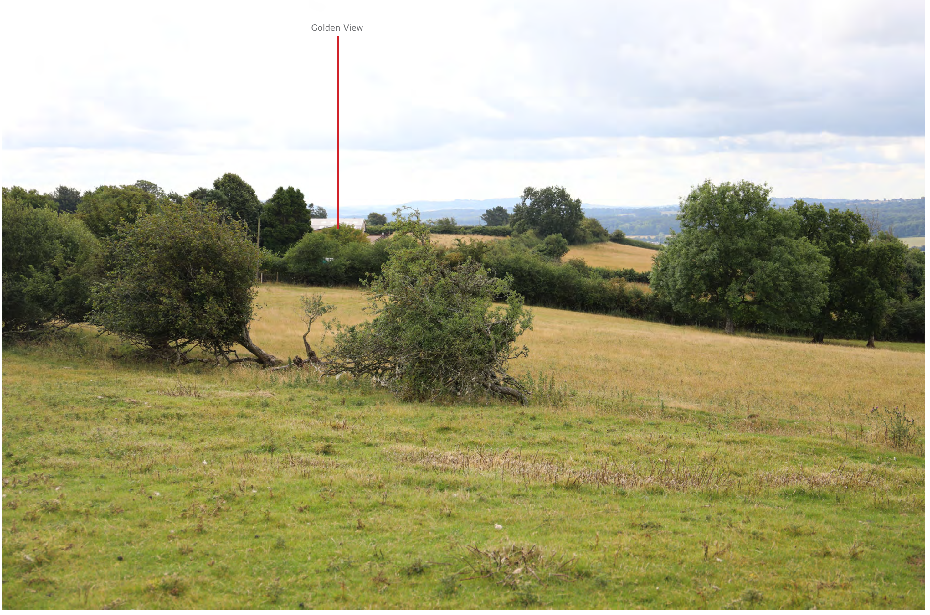
Viewpoint 7 - View from right of way DO1 looking towards the direction of the site.