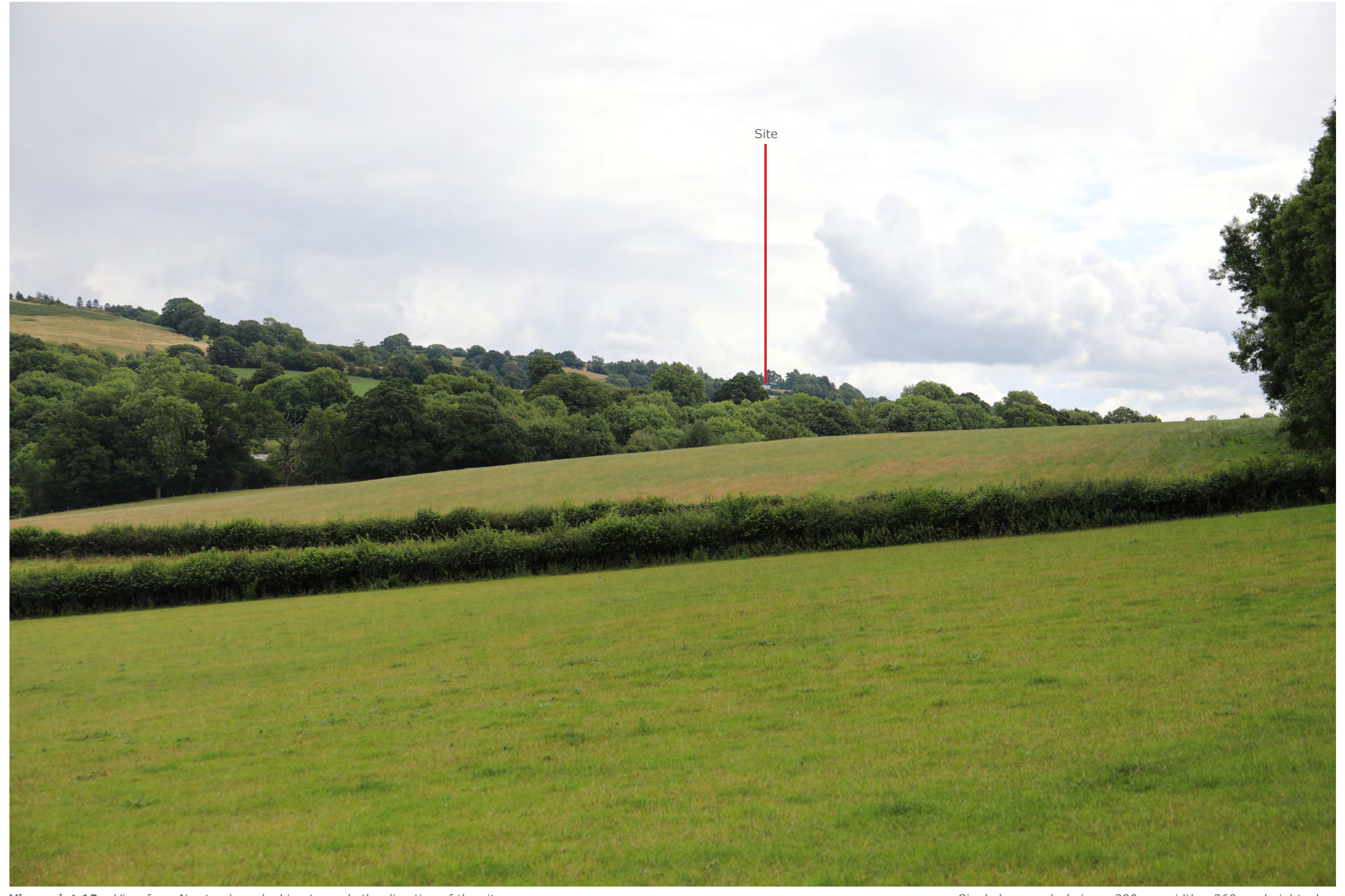
Viewpoint 12 – View from Newton Lane looking towards the direction of the site.