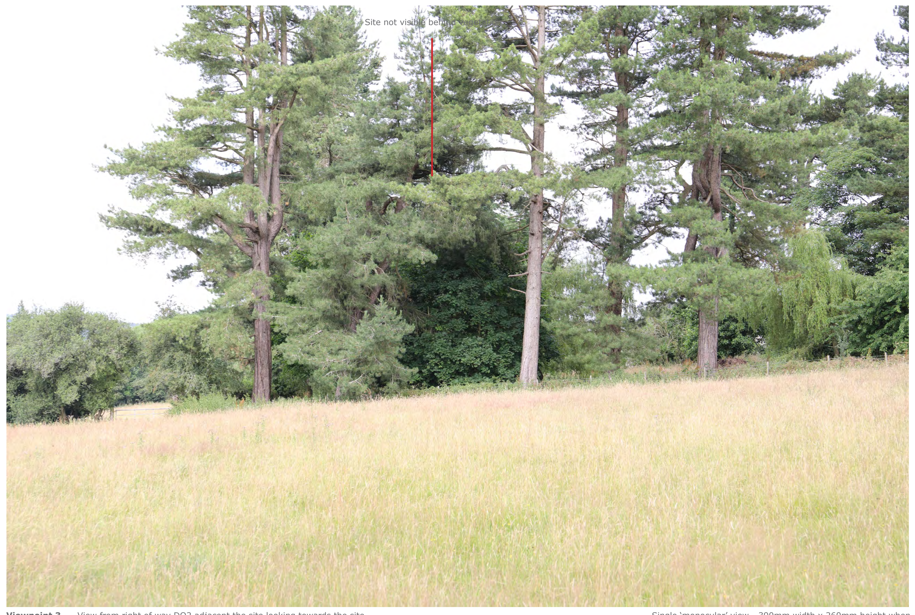
Viewpoint 3 – View from right of way DO2 adjacent the site looking towards the site.