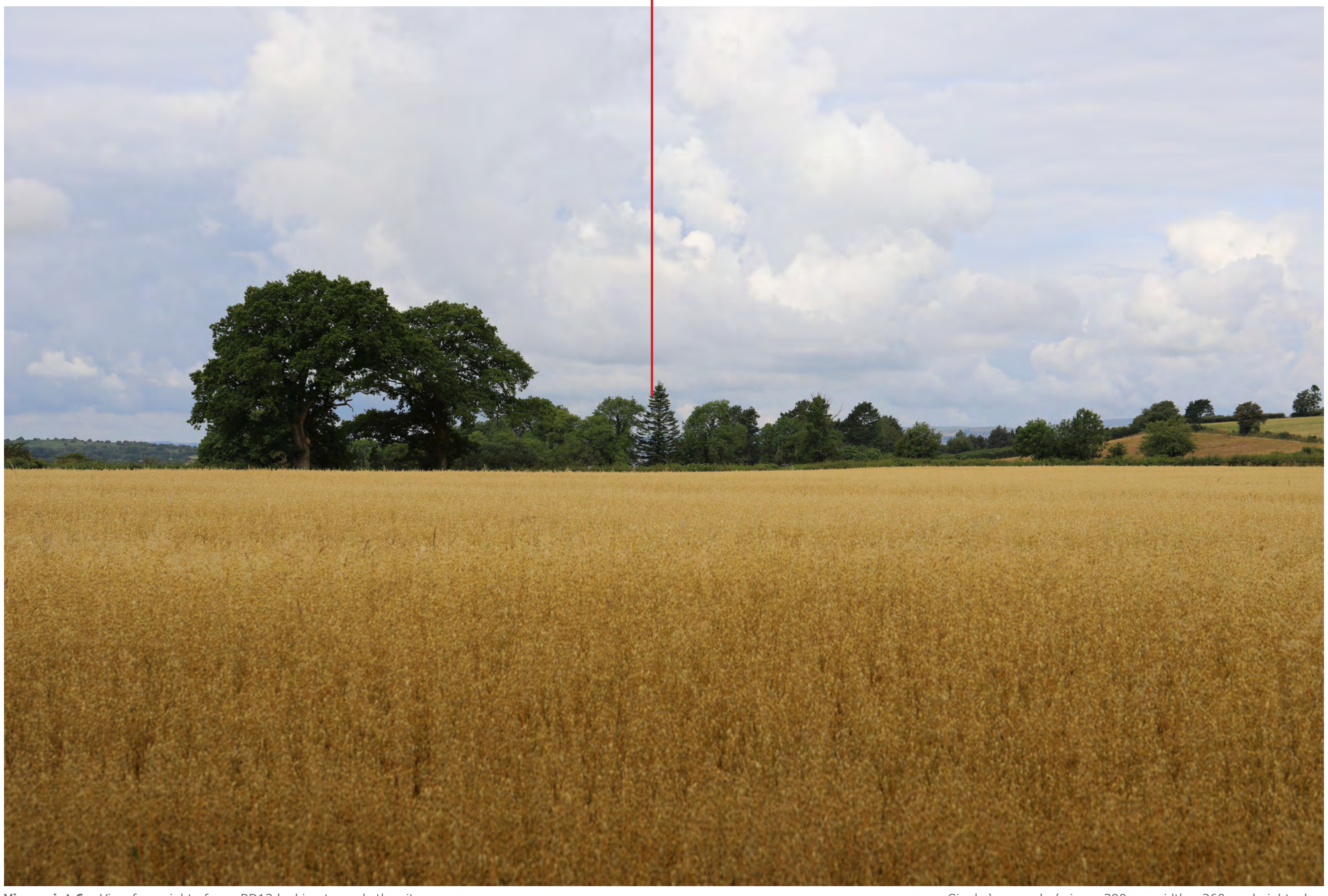
Viewpoint 6 – View from right of way BD12 looking towards the site.