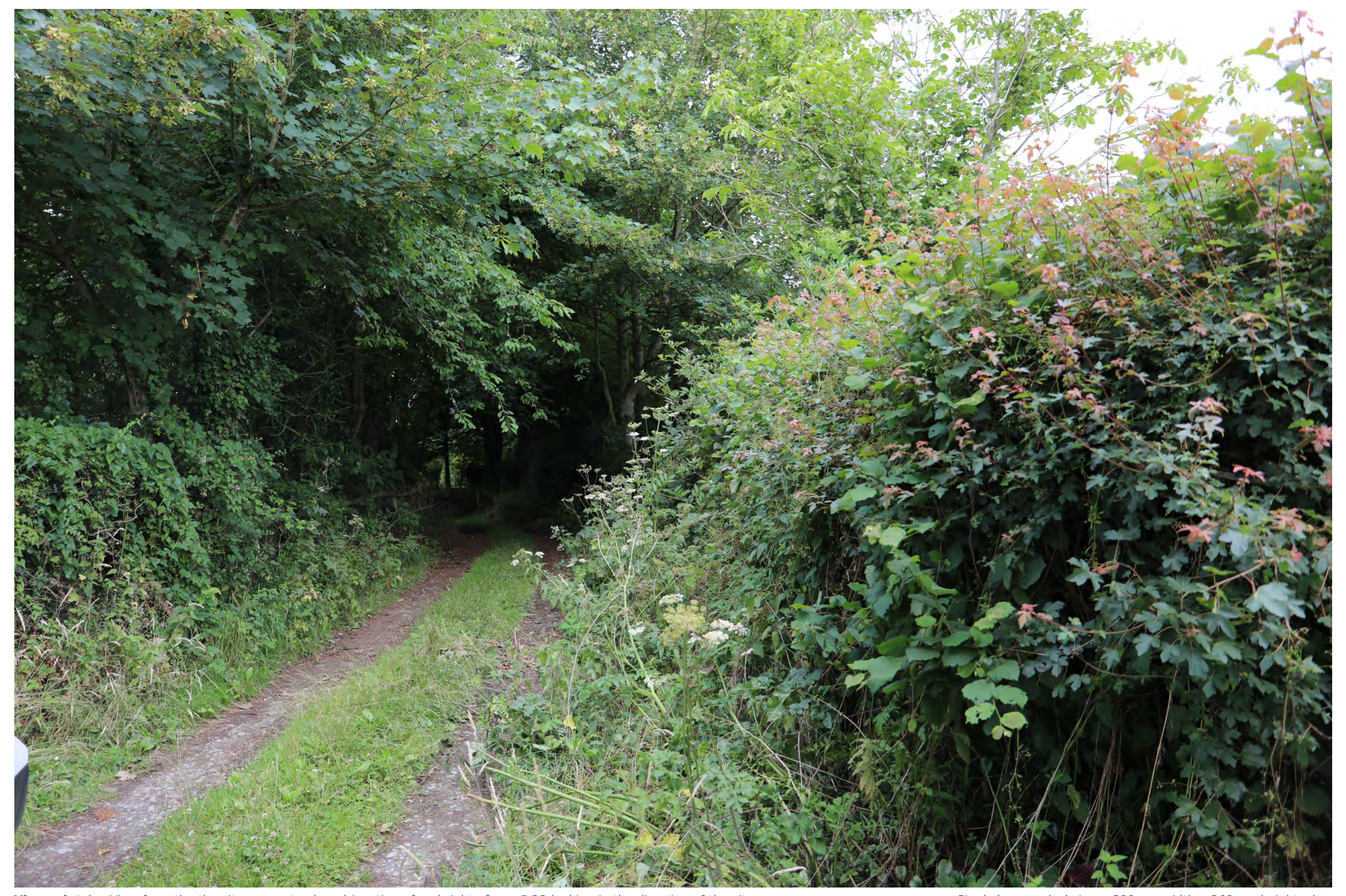
Viewpoint 1 - View from the the site access track and junction of and right of way DO2 looking in the direction of the site.