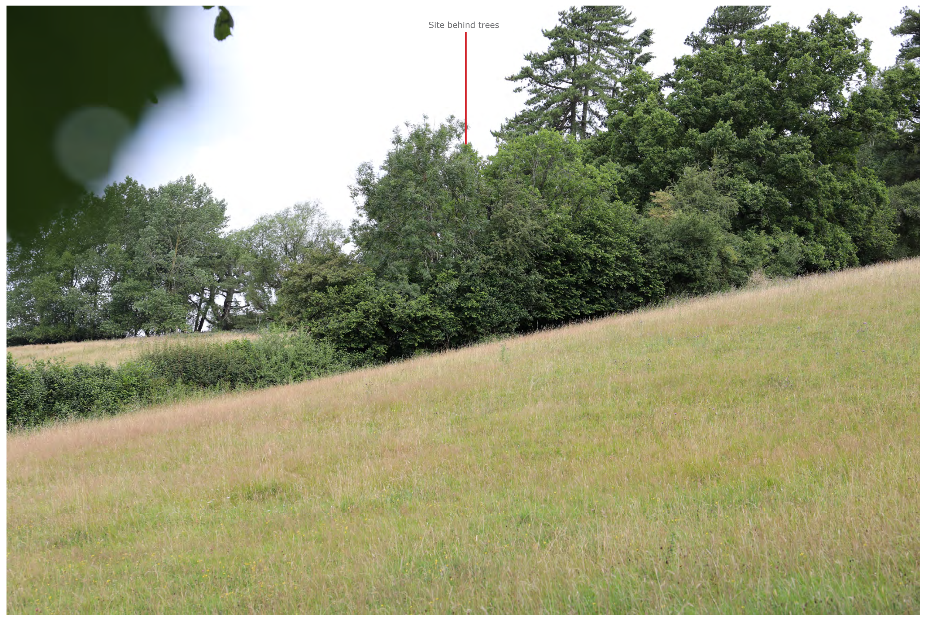
Viewpoint 4 – View from right of way DO2 looking towards the direction of the site.