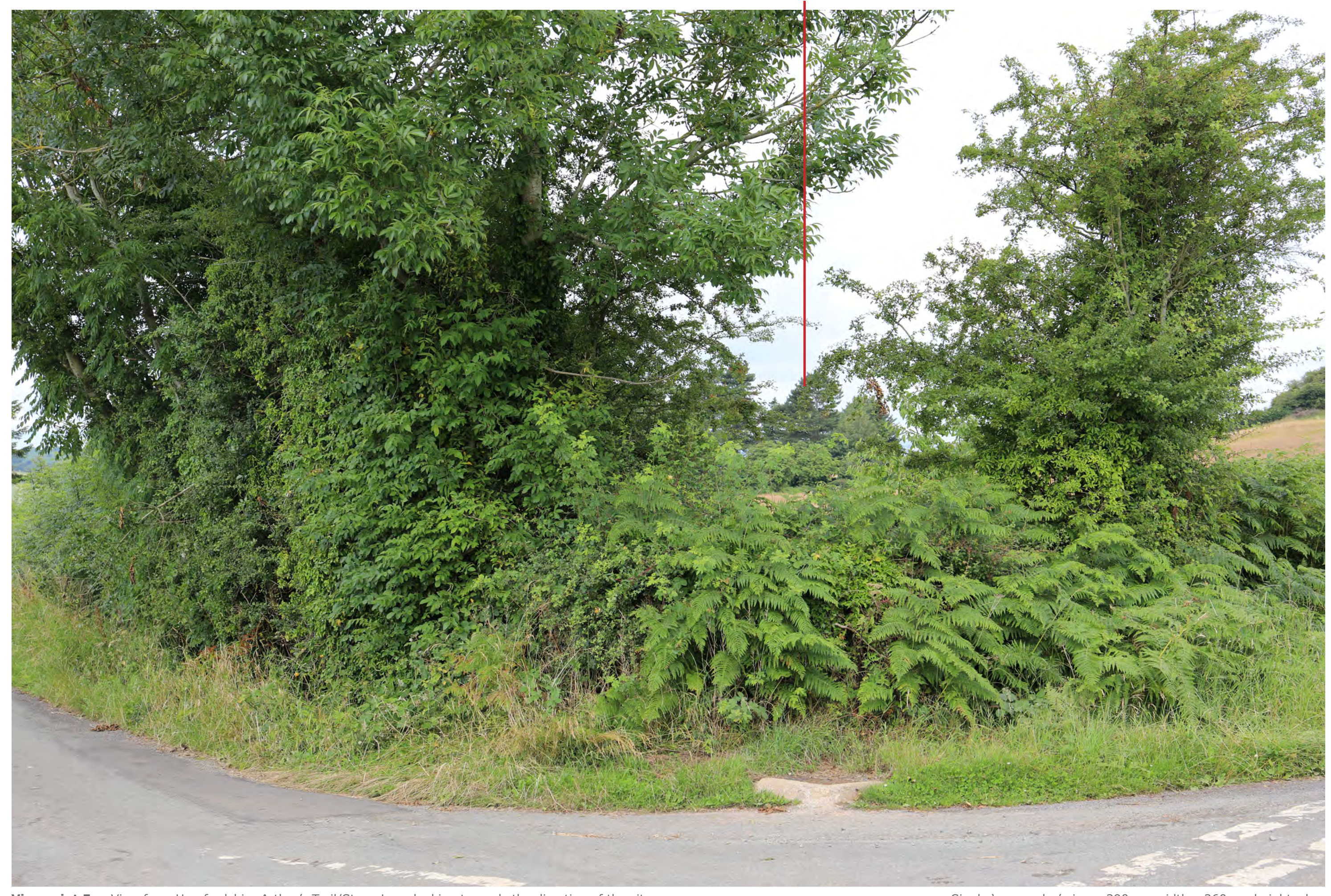
Viewpoint 5 – View from Herefordshire Arthur's Trail/Stone Lane looking towards the direction of the site.