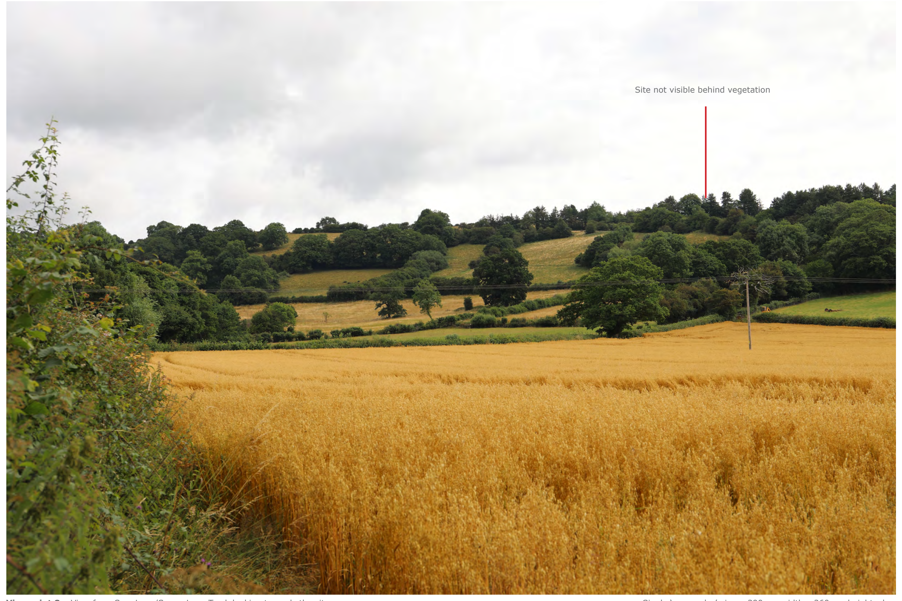
Viewpoint 8 – View from Scar Lane/Spoon Lane Track looking towards the site.