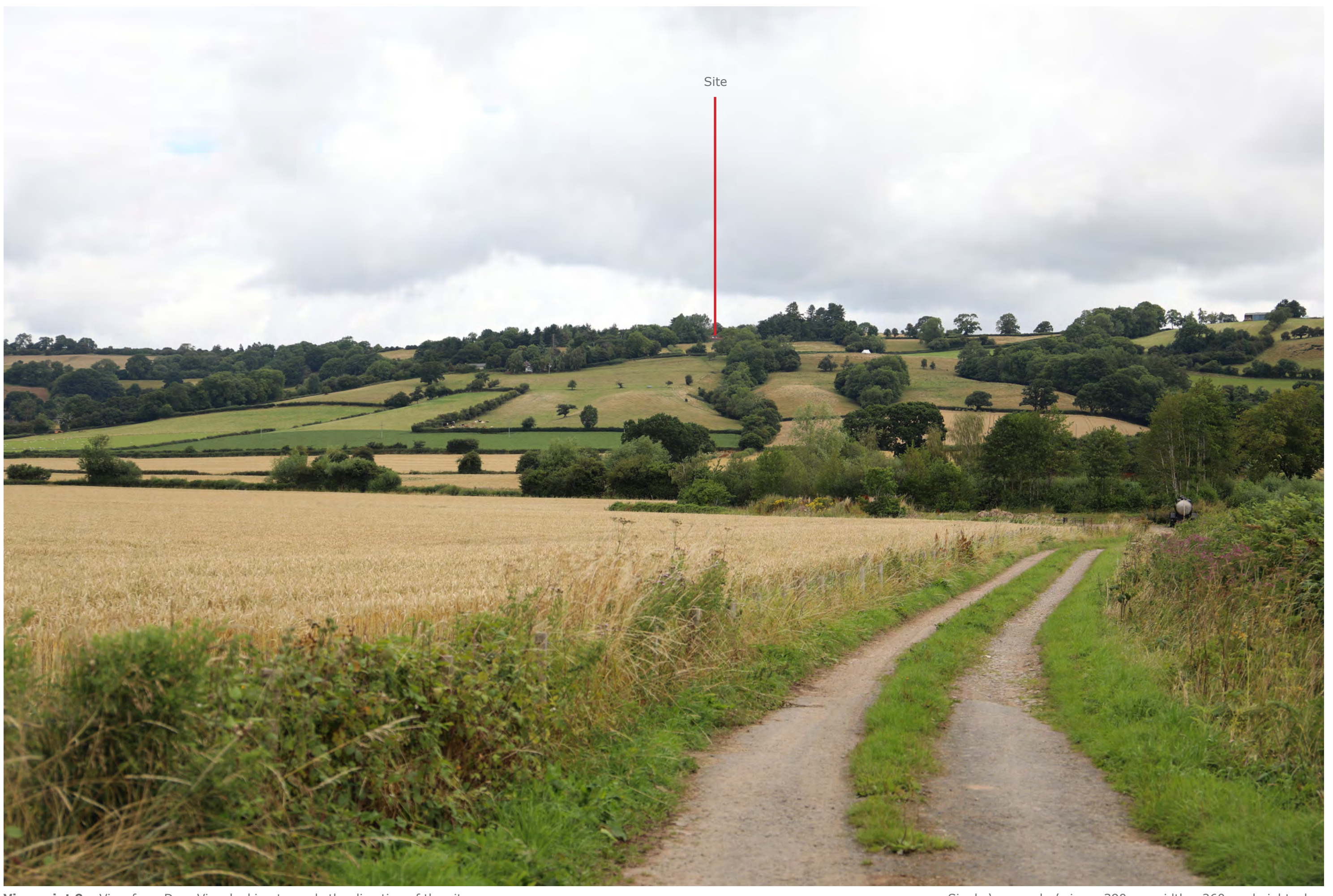
Viewpoint 9 – View from Dore View looking towards the direction of the site.