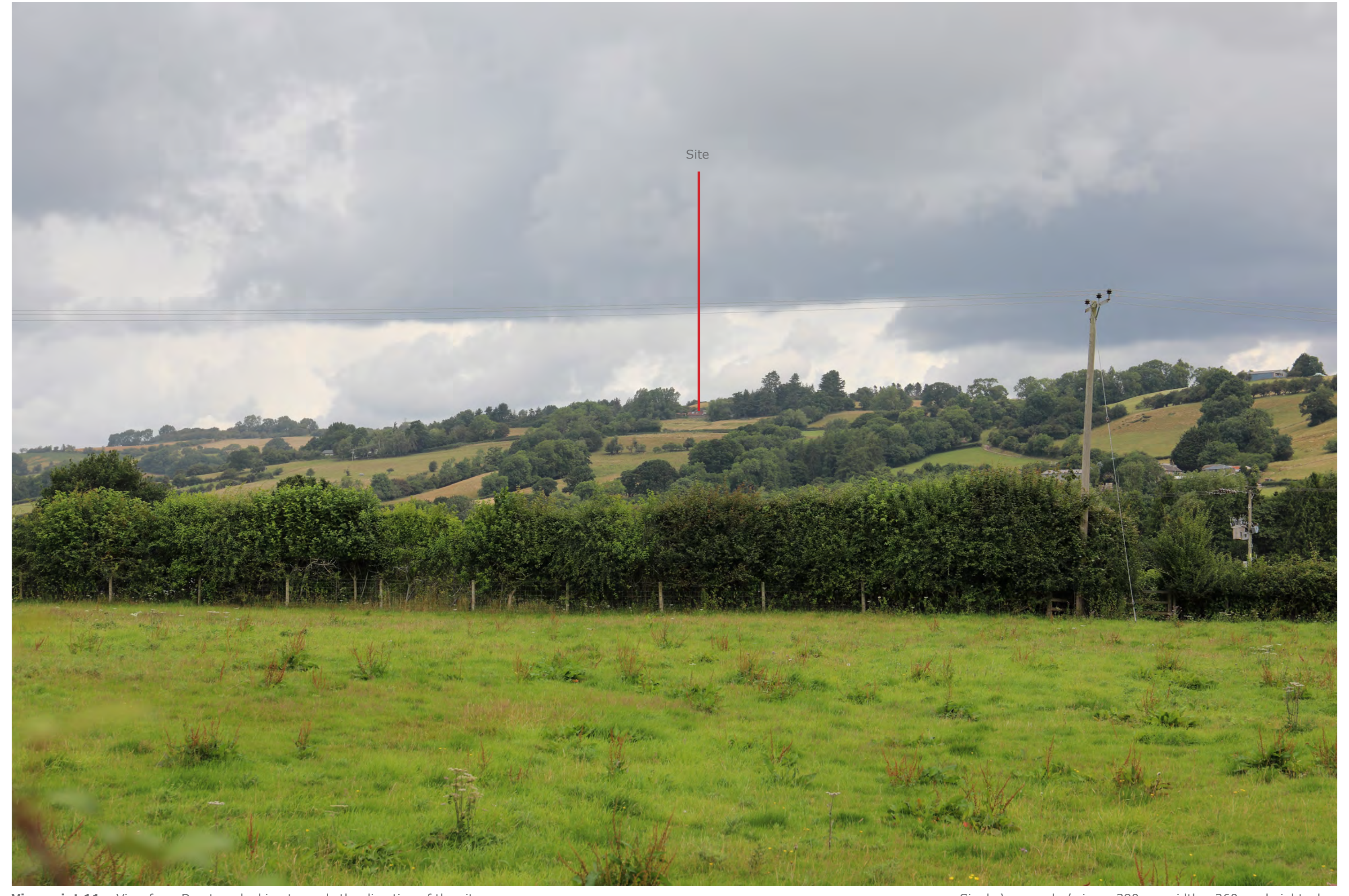
Viewpoint 11 – View from Dorstone looking towards the direction of the site.