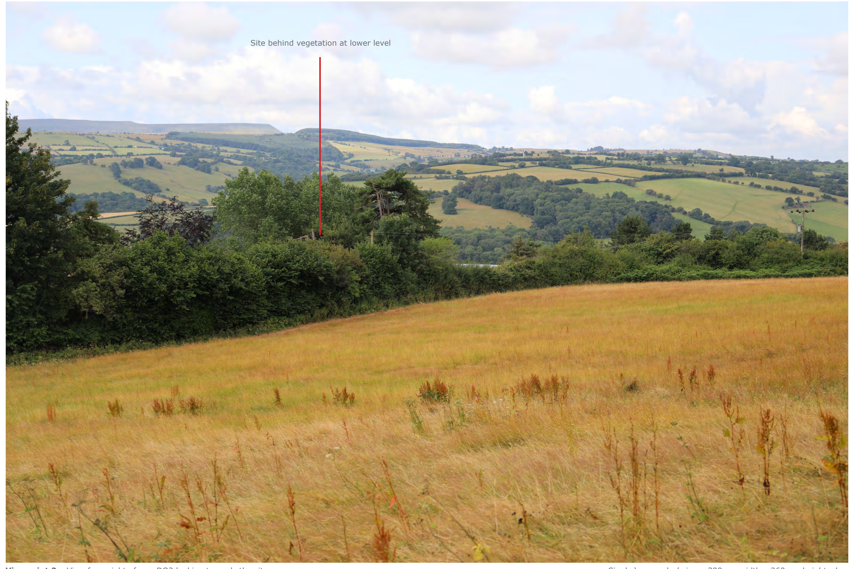
Viewpoint 2 – View from right of way DO2 looking towards the site.