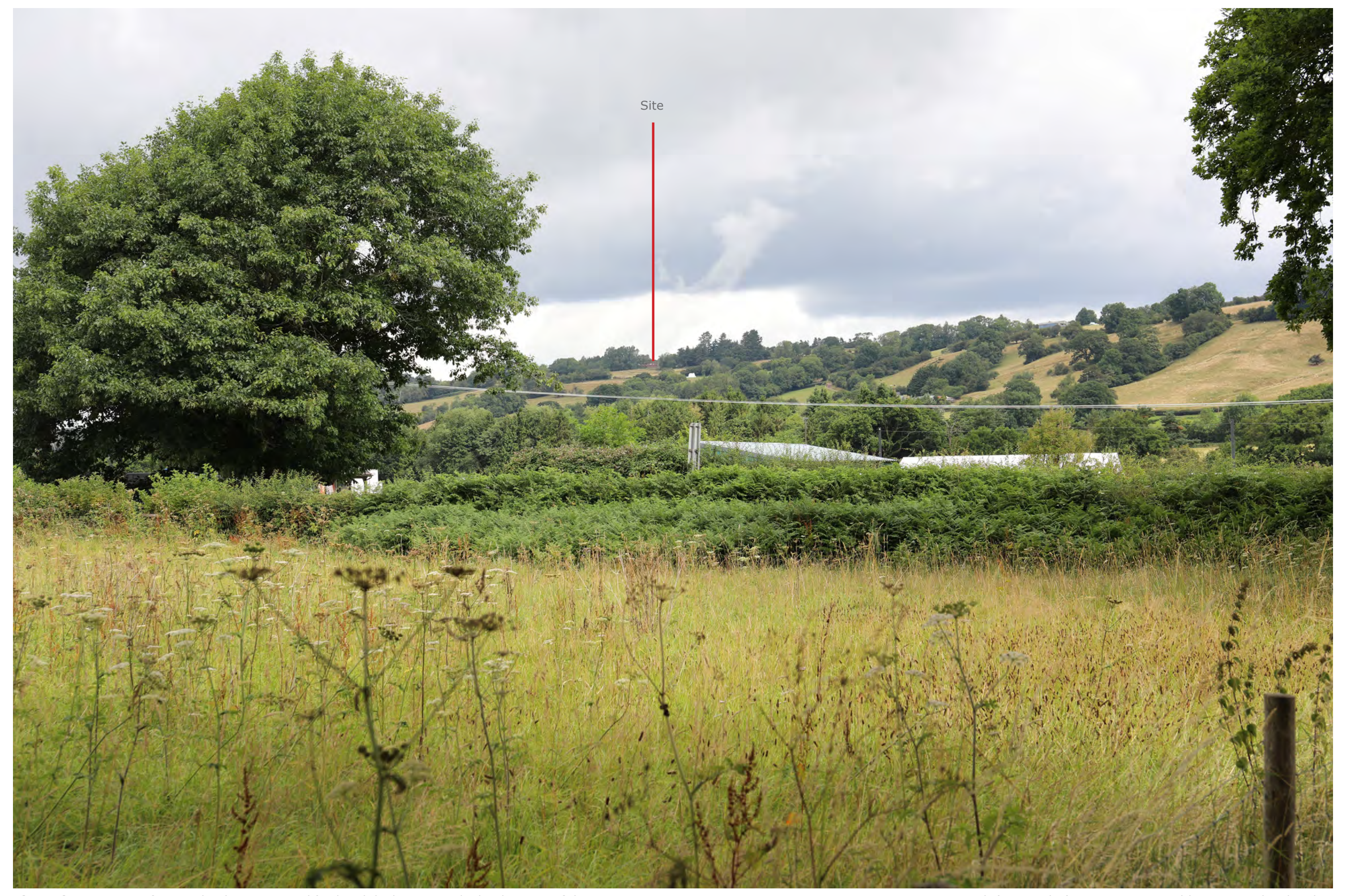
Viewpoint 10 – View from path adjacent St Faith's Church looking towards the direction of the site.