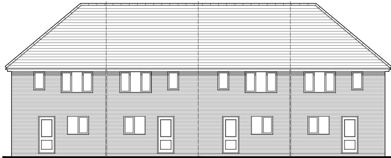
QA3B5PH REAR ELEVATION

*HQI scores are based on minimum requirements:- Unit Size - 41, Unit Layout - 32, Unit Services - 22