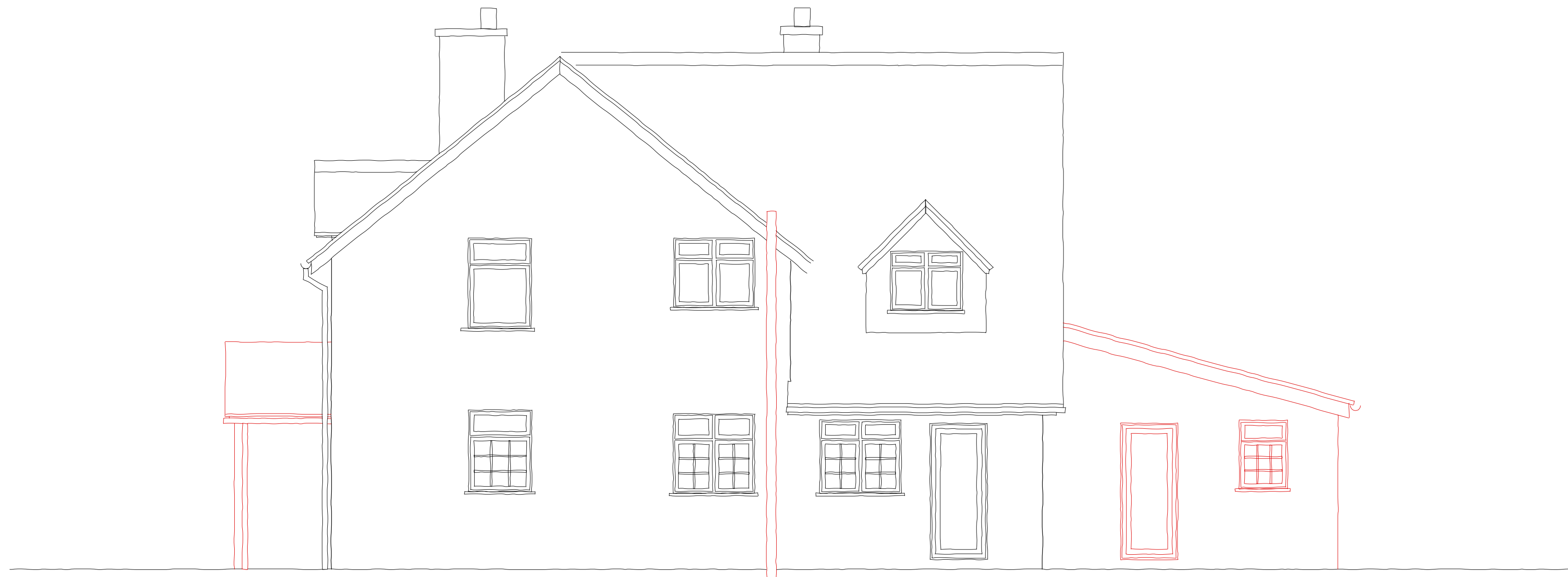
2 Existing East Elevation Scale: 1:50