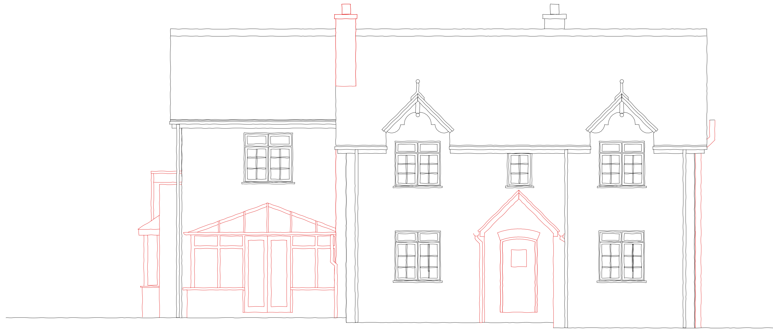
1 Existing South Elevation Scale: 1:50

1 Do not scale from this drawing. 2 Any discrepancies to be referred to the Architect. 3 This drawing is to be read in conjunction with all relevant Specifications and other drawings issued by the Architect, Structural Engineer and other Consultants or Specialists. 4 This drawing is copyright and is not to be reproduced in part or whole without prior expressed permission of Thomas Studio Ltd.