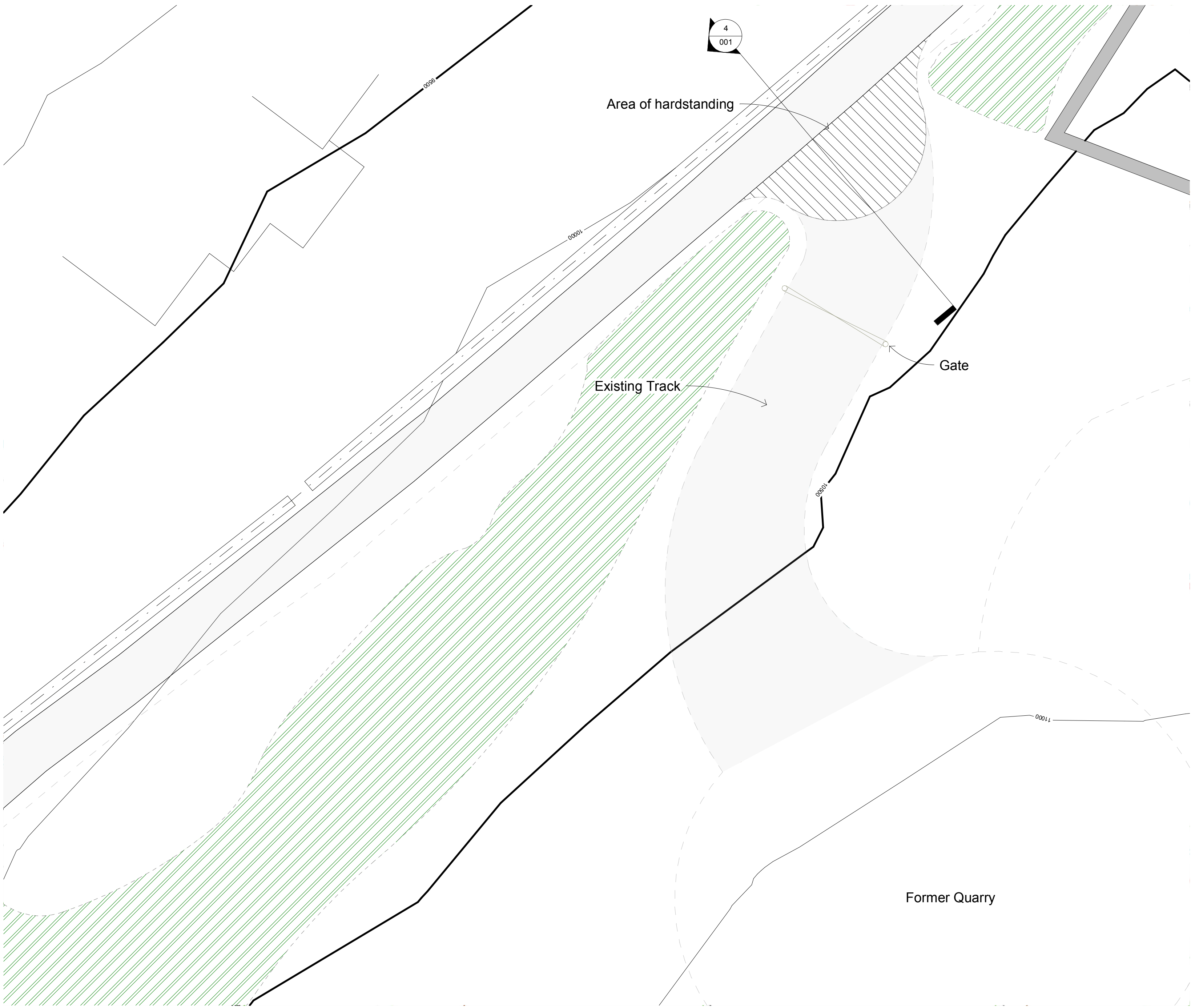
Access Detail 1 : 100