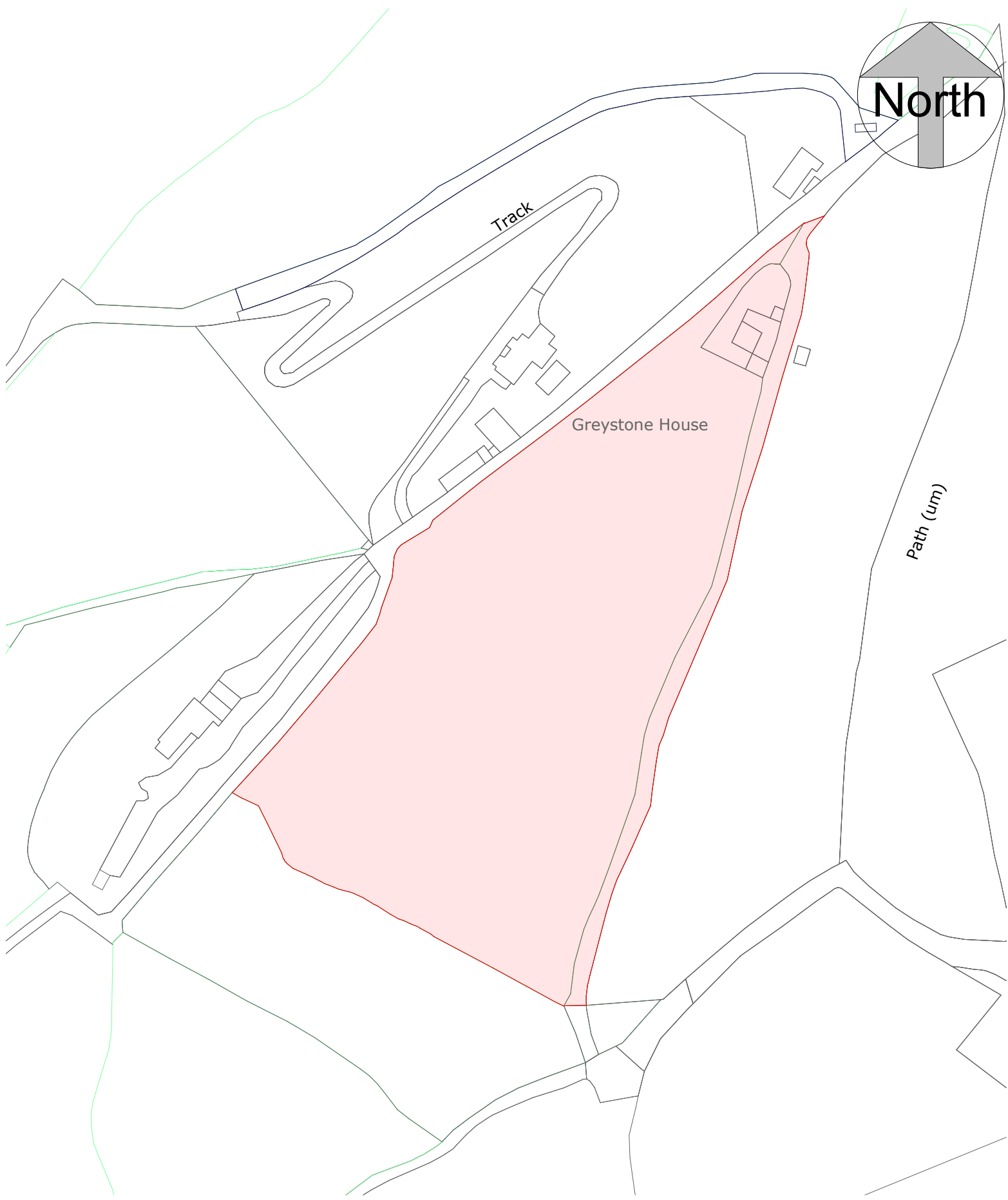
Location Plan 1 : 1250