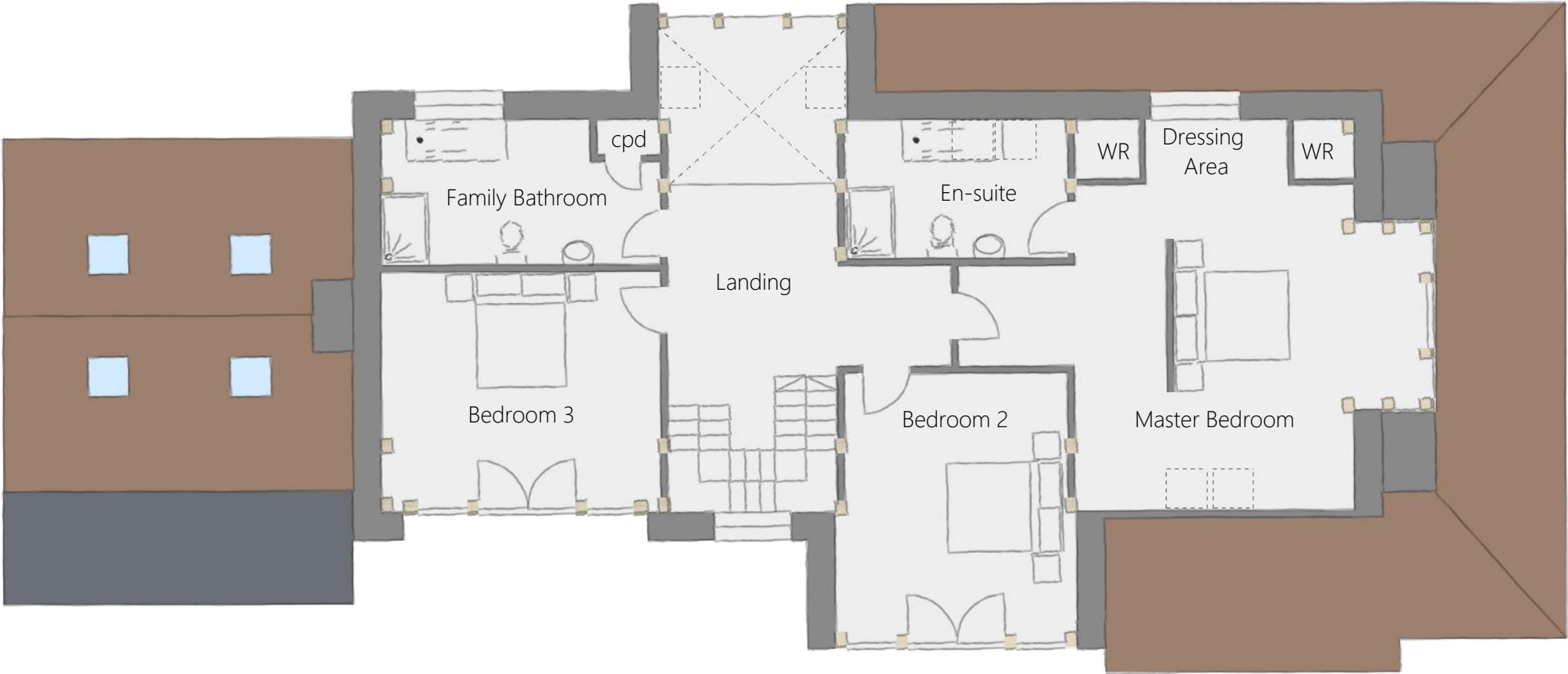
FIRST FLOOR Scale 1:100