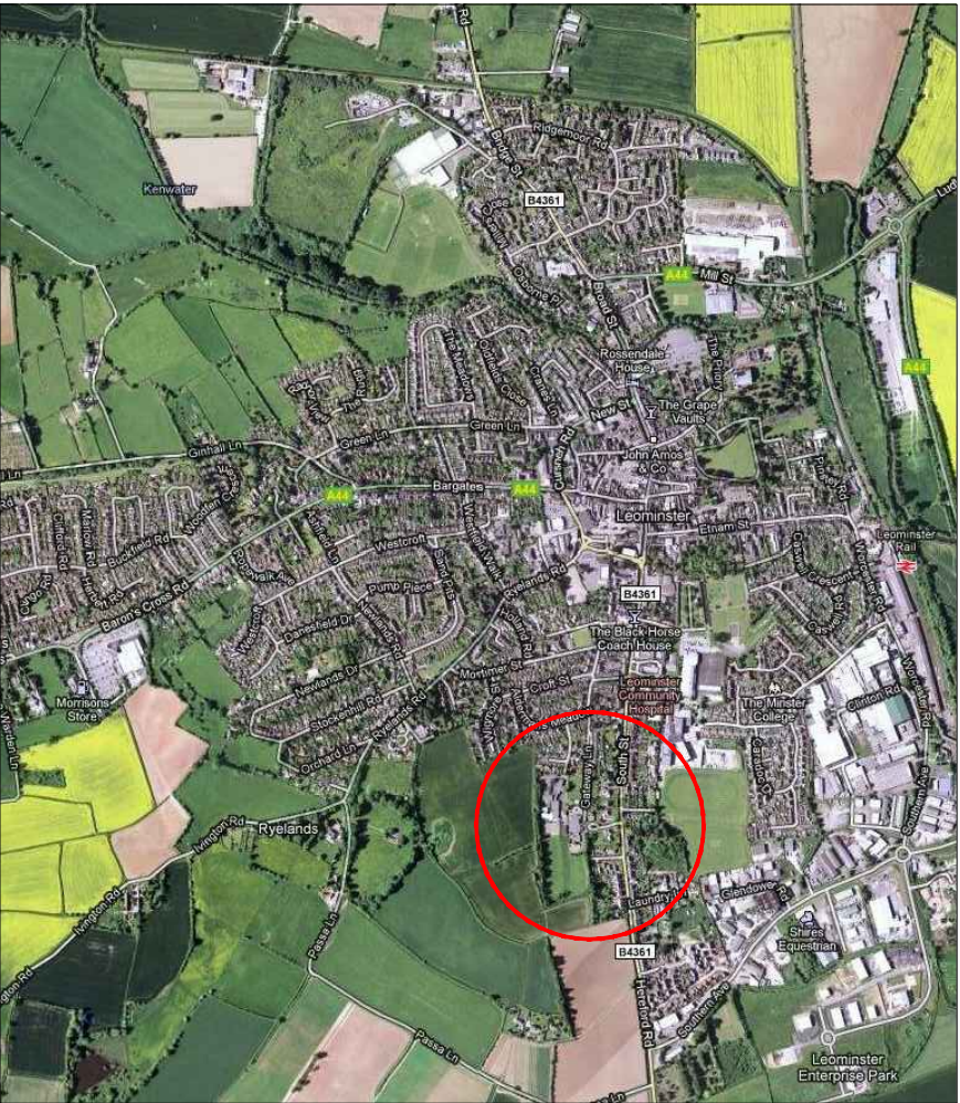
AERIAL VIEW OF LEOMINSTER - NOT TO SCALE