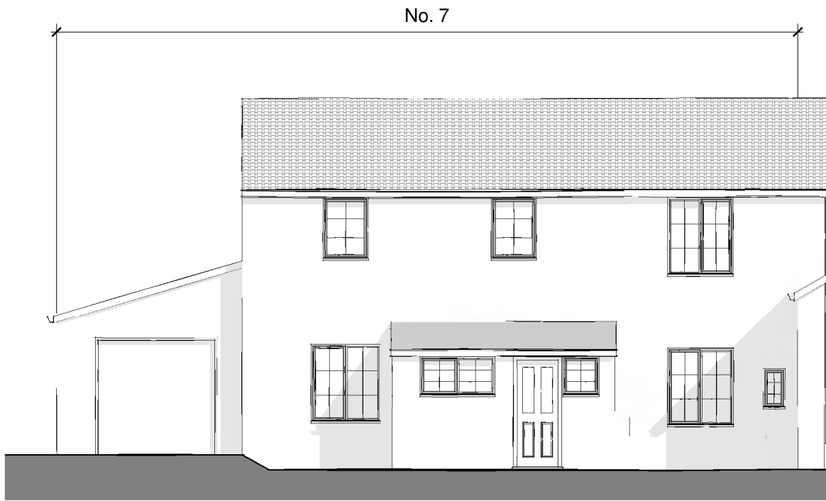
3 South 1 : 100