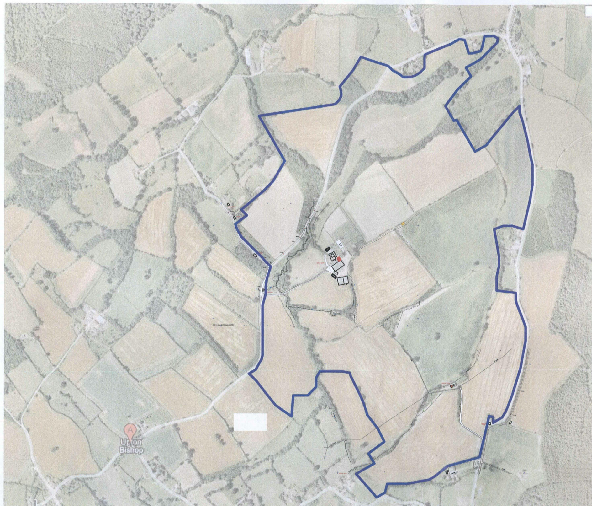
LOCATION PLAN 1:10,000

HEREFORDSHIRE COUNCIL PLANNING SERVICES DEVELOPMENT CONTROL 10 AUG 2012 To: Ack'd: File: