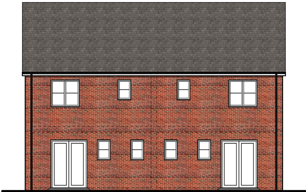
Plot 31 Rear Elevation