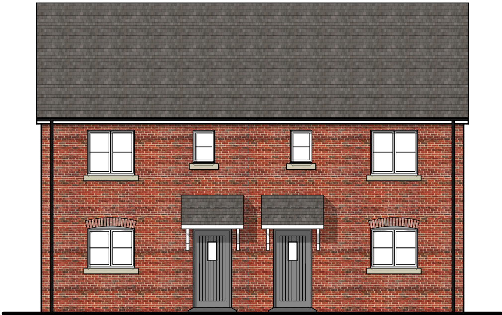
Plot 30 Front Elevation

-: 17.03.21 - DC: Drawing created. A: 12.04.21 - LM - BWWh: Key stones removed. Materials key amended. Eave height amended. B: 04.05.21 - BWWh - RJF: Front elevation windows amended. C: 17.05.21 - BWWh - RJF: Scale bar added.