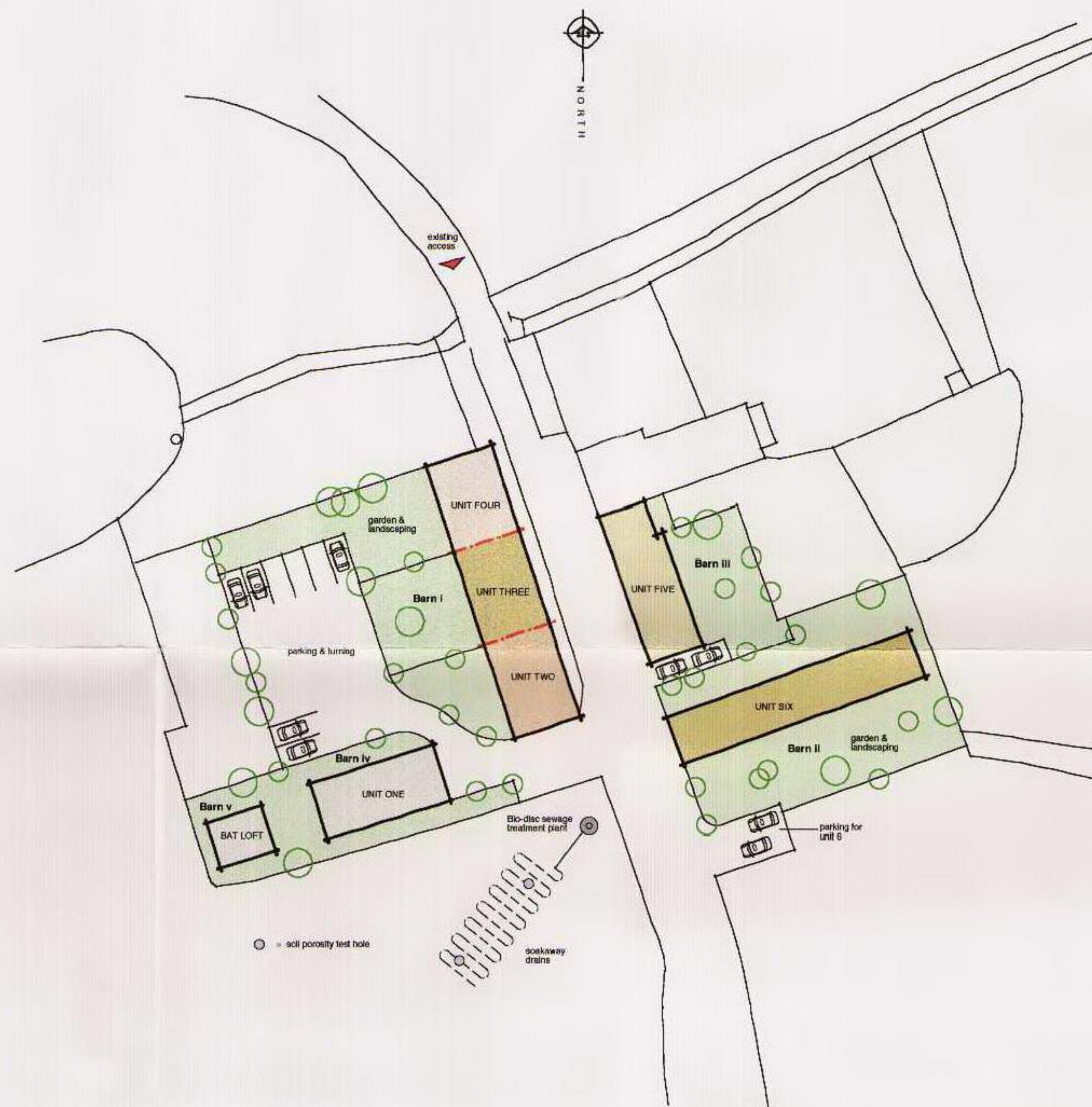
Site plan as proposed