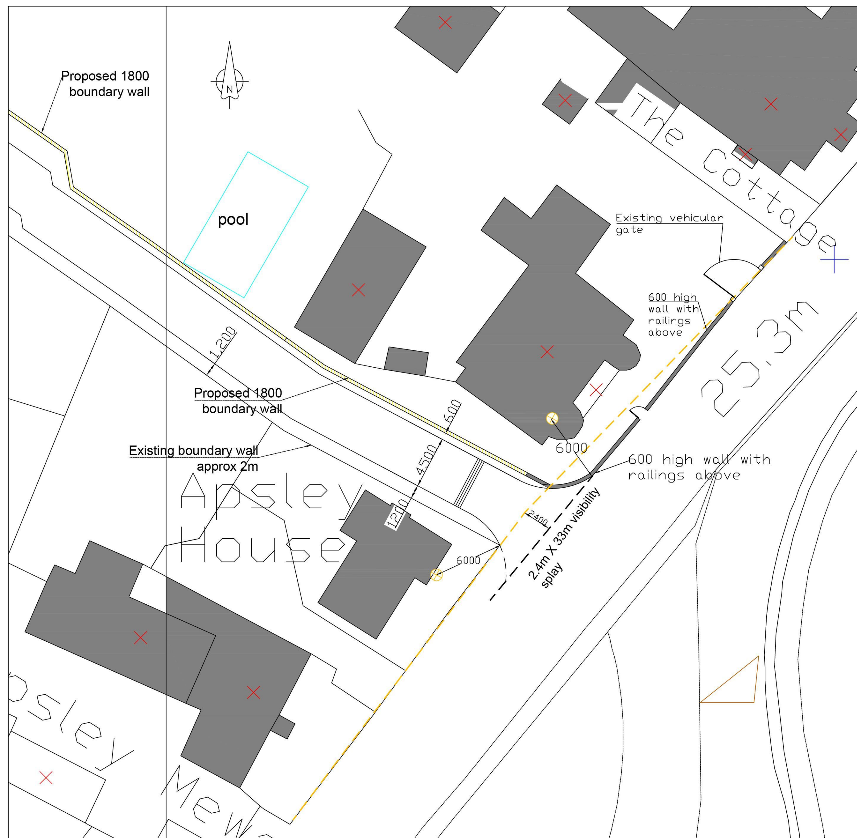
Site Layout 1:200