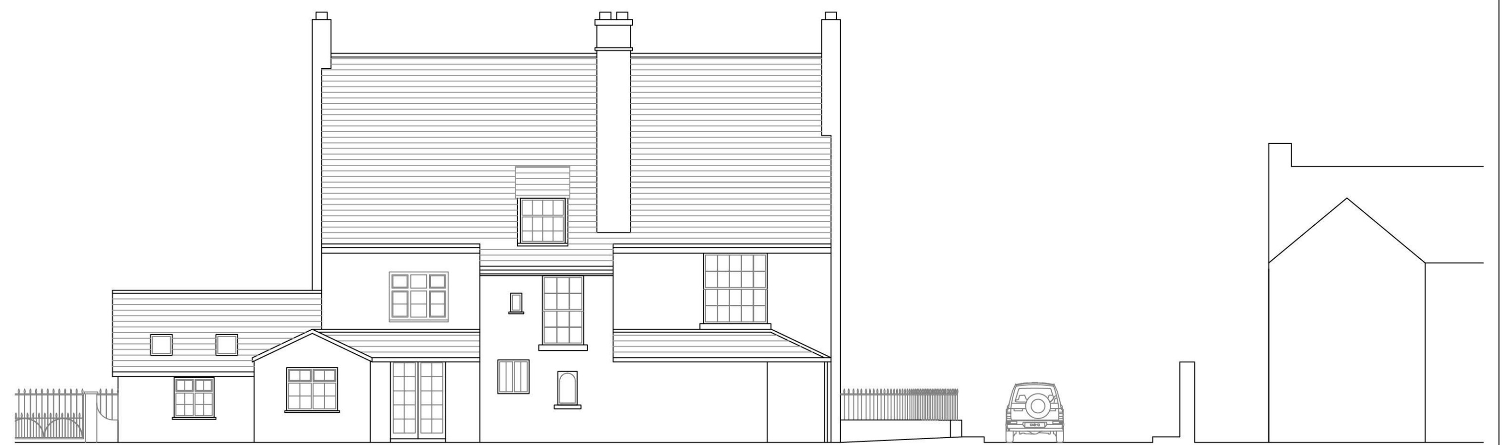
NORTH WEST ELEVATION 1:100