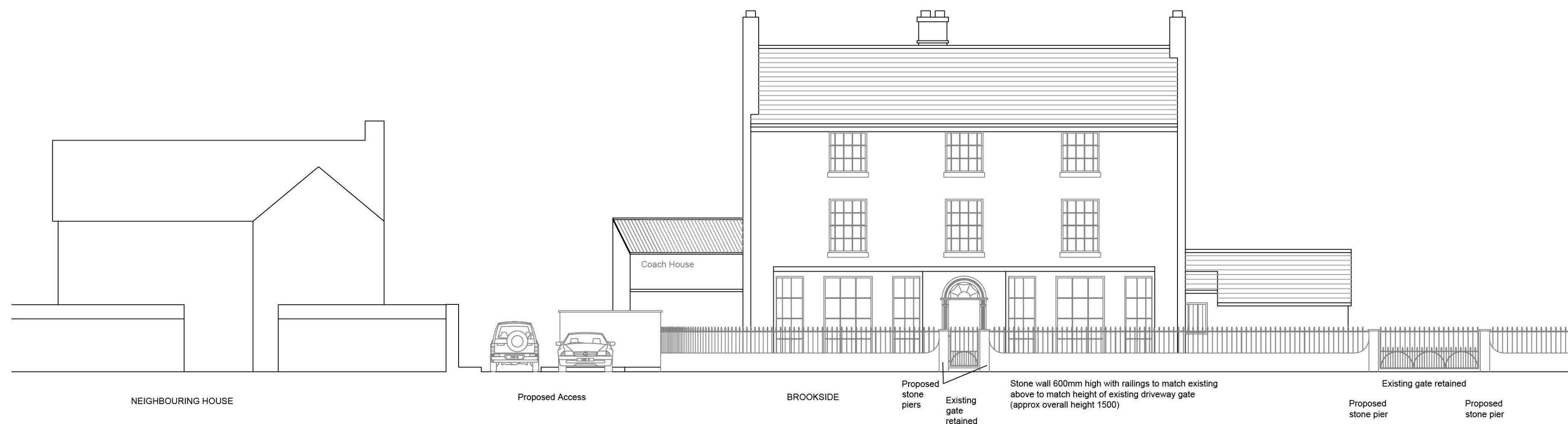
PROPOSED STREET ELEVATION 1:100

Project: proposed residential development at Brookside, Whitchurch.