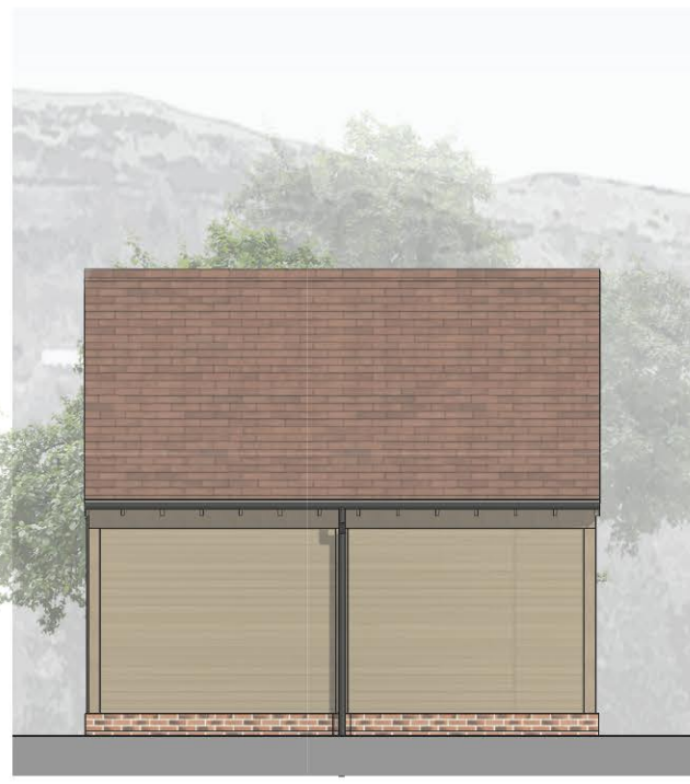
Proposed Rear Elevation 1 : 100