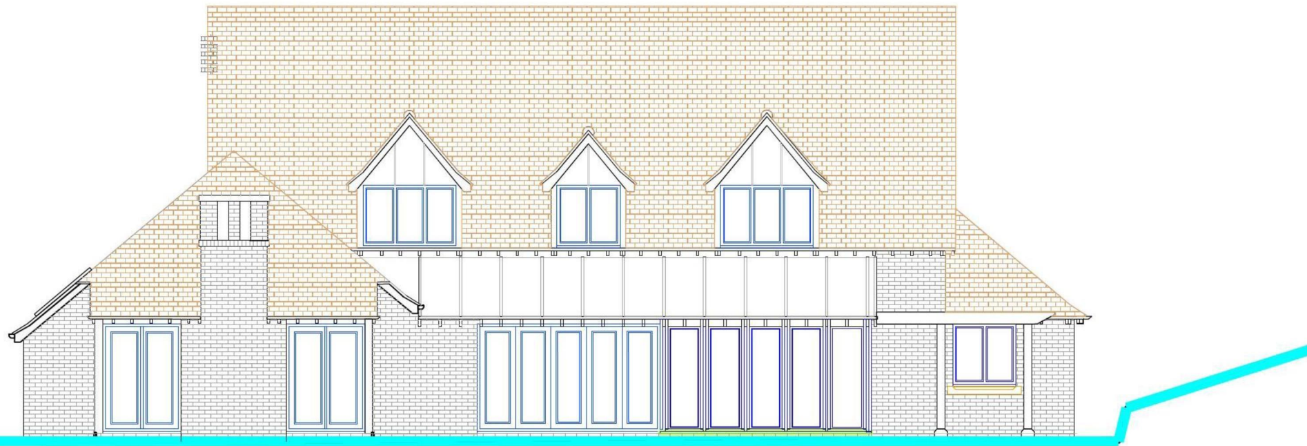
Rear Elevation West