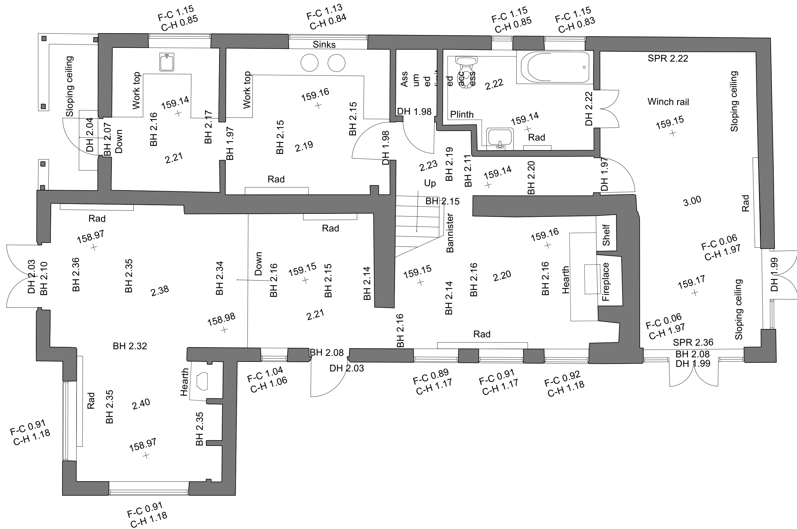
1 Ground Floor Plan - Existing