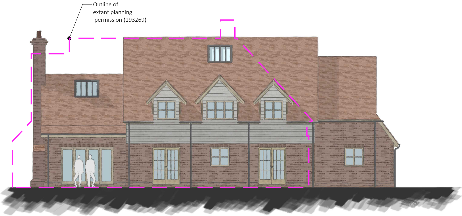
REAR ELEVATION Proposed Scale 1:100