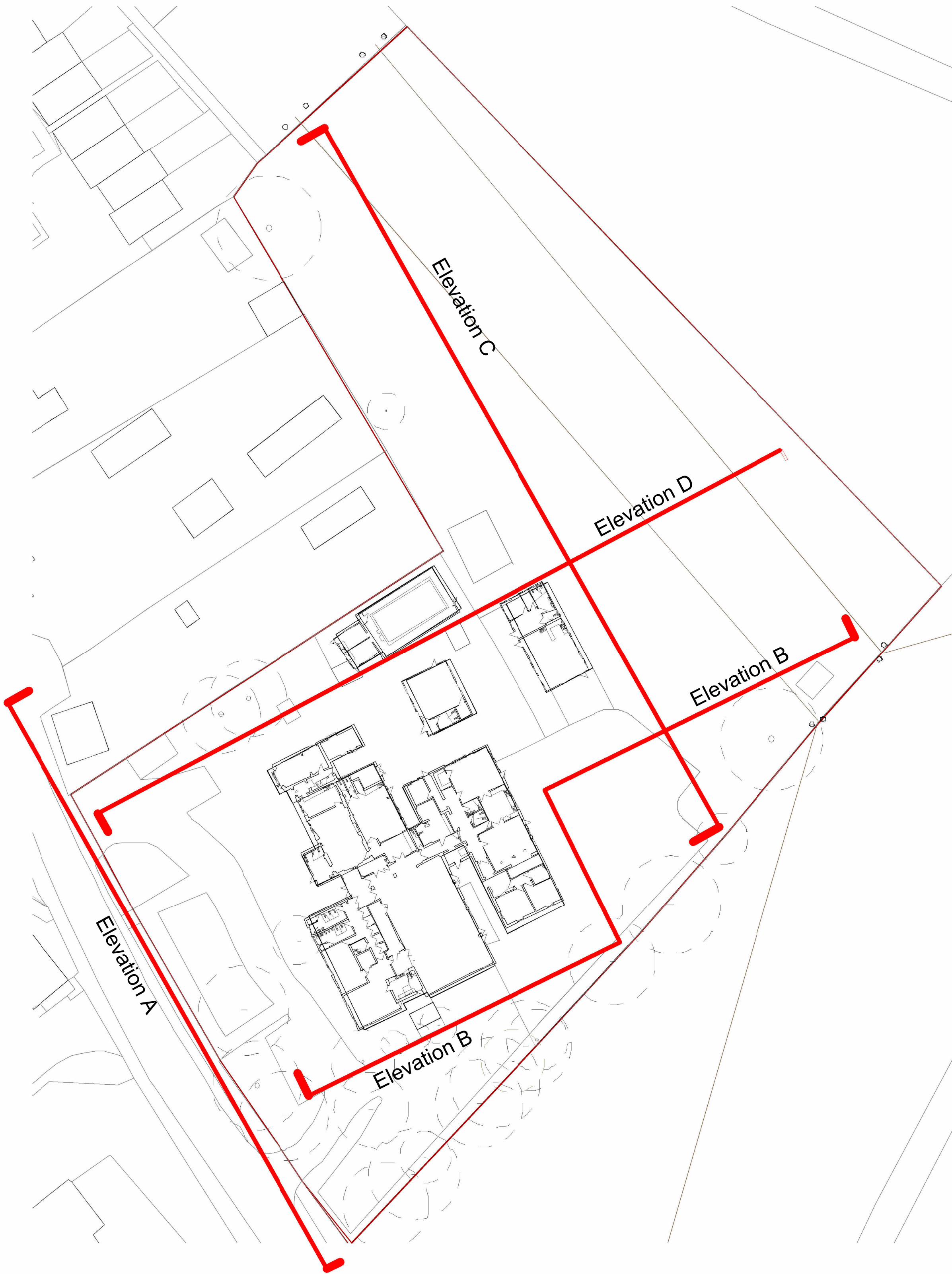
Existing Elevation Reference Plan (Not to scale)