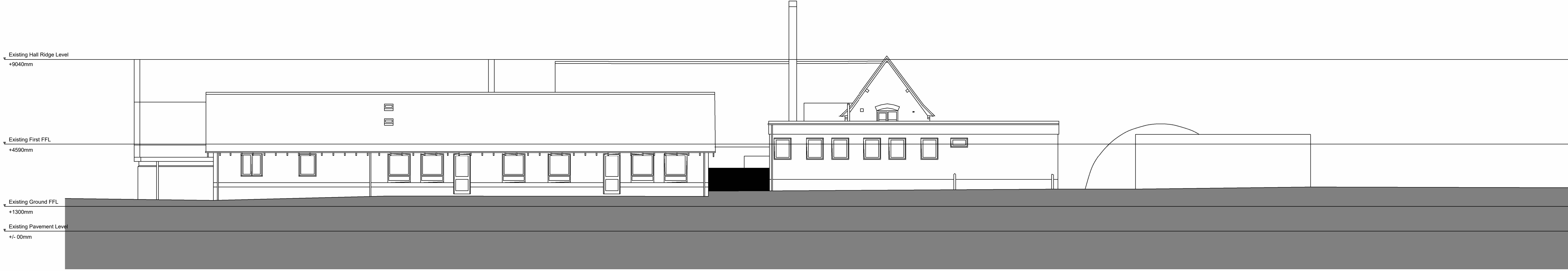
Elevation C 1:100