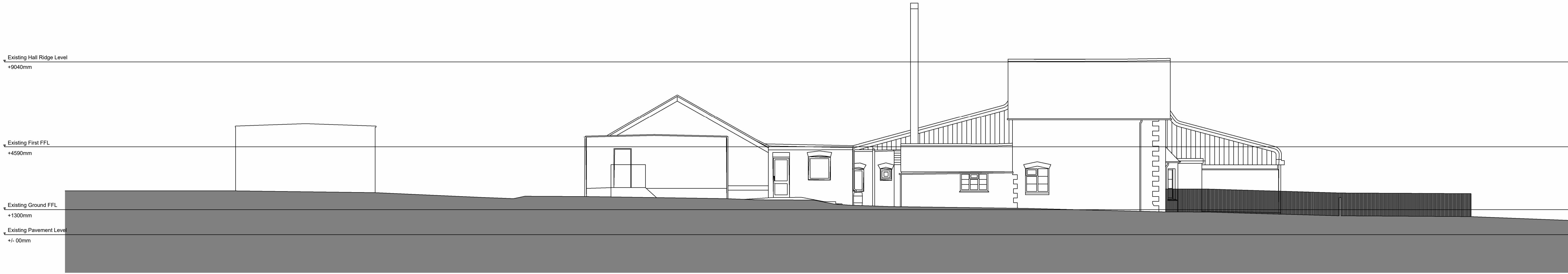
Elevation D 1:100