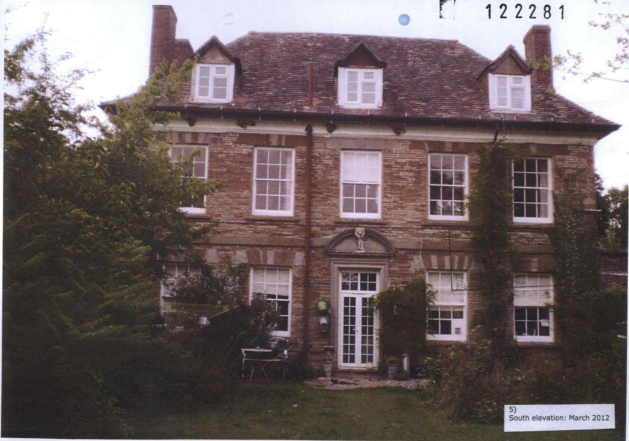
5) South elevation: March 2012