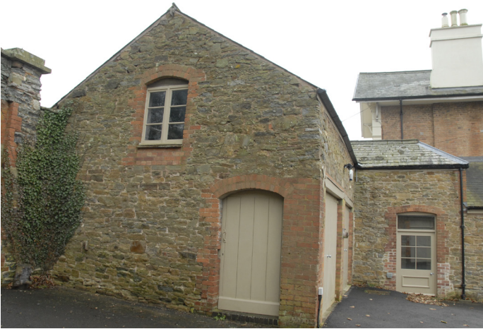
NEW KIT ROOM DOOR TO MATCH EXISTING GARAGE SIDE DOOR ON OPPOSITE GABLE END.