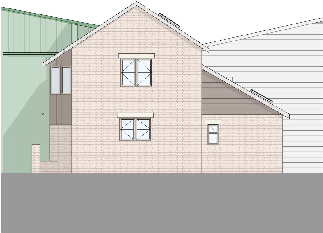
E-06 Existing Side Elevation