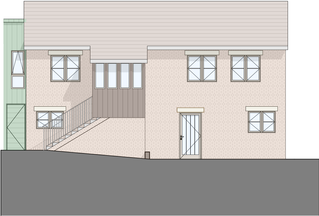
E-05 Existing Front Elevation