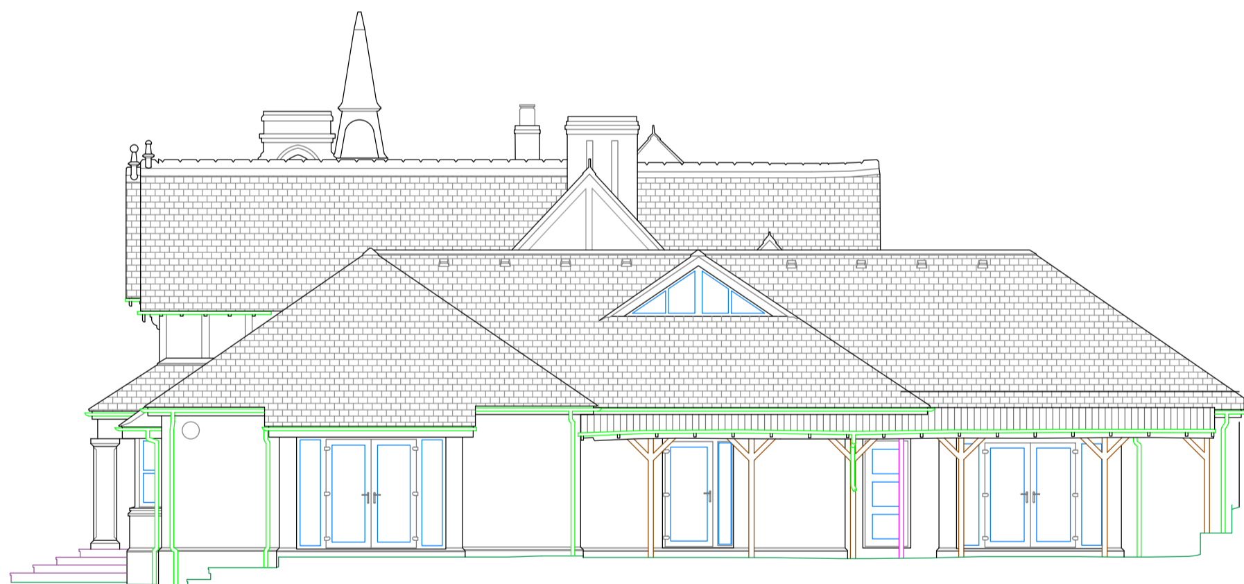
SOUTH EAST (SIDE)