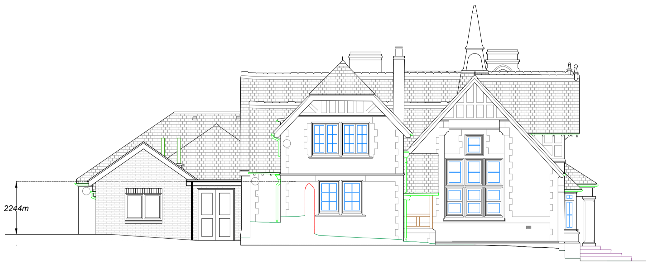
NORTH WEST (SIDE)