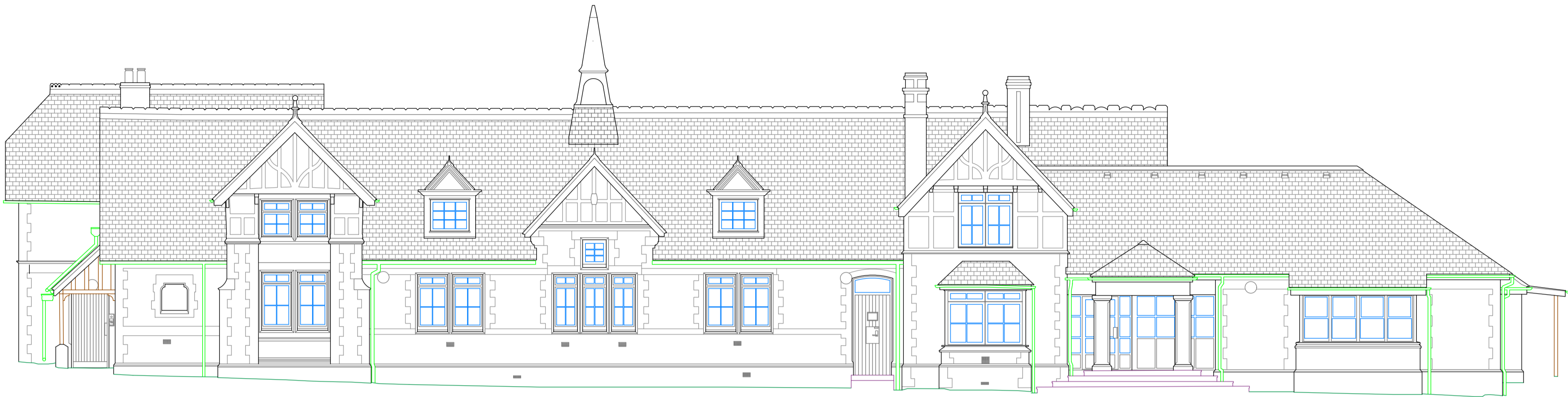
SOUTH WEST (FRONT)