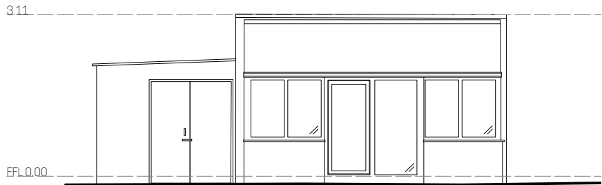
EXISTING SIDE ELEVATION 1:100@A3