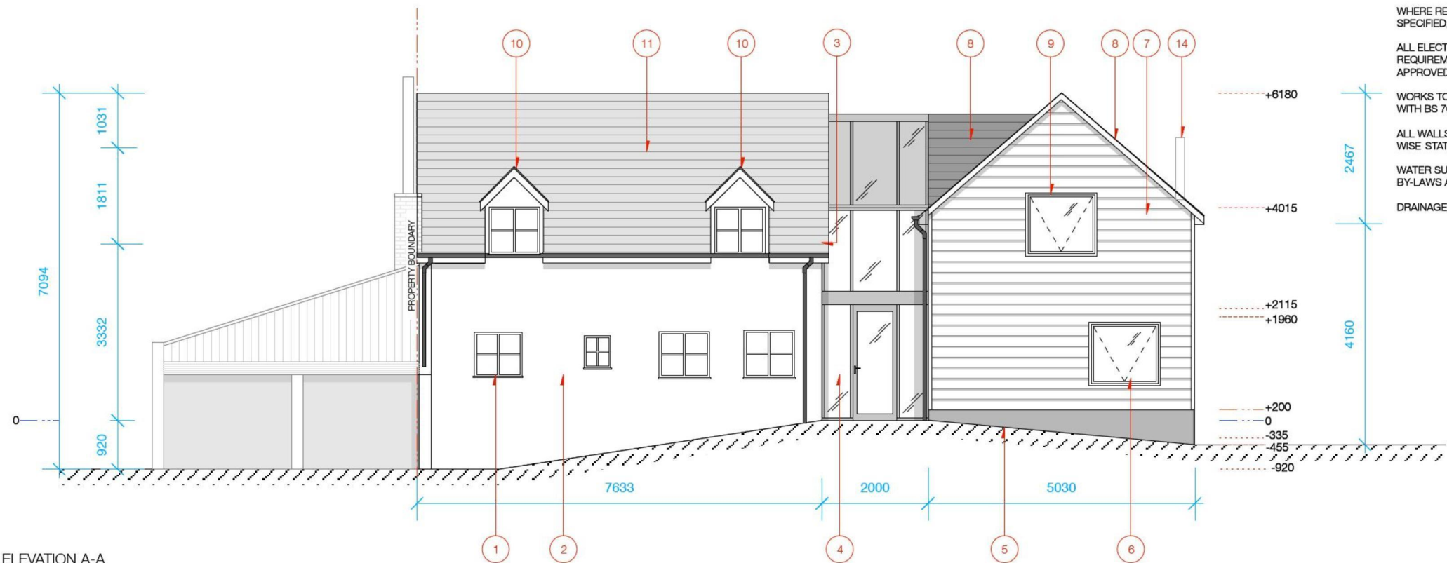
01 PROPOSED ELEVATION A-A Scale 1:100