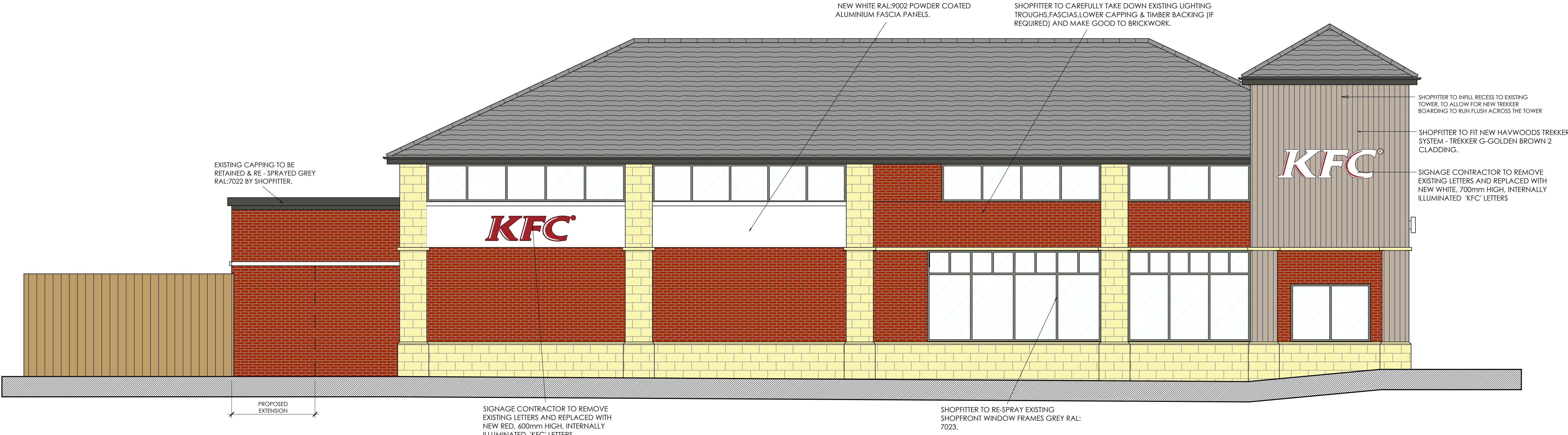
Proposed side elevation facing commercial road scale - 1:100 @ A1 / 1:200 @ A3