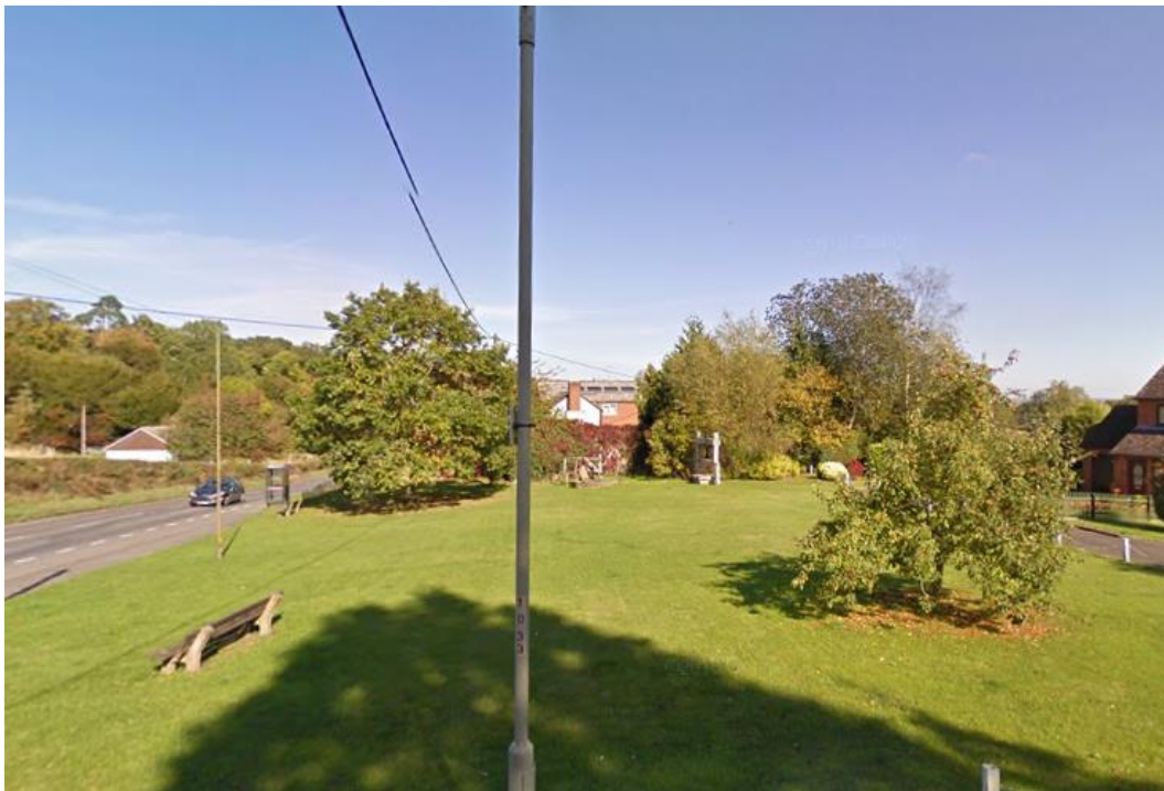
Figure 3 - View of proposed site from West