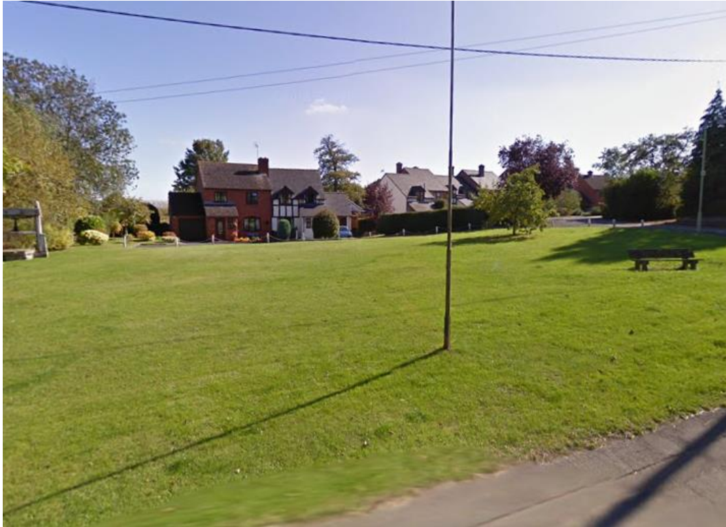
Figure 2 – View of proposed site from North