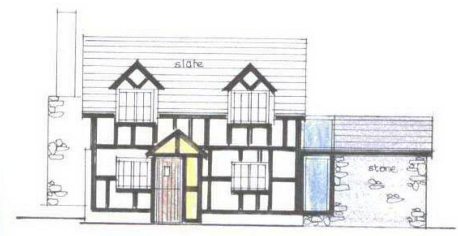
east front elevation