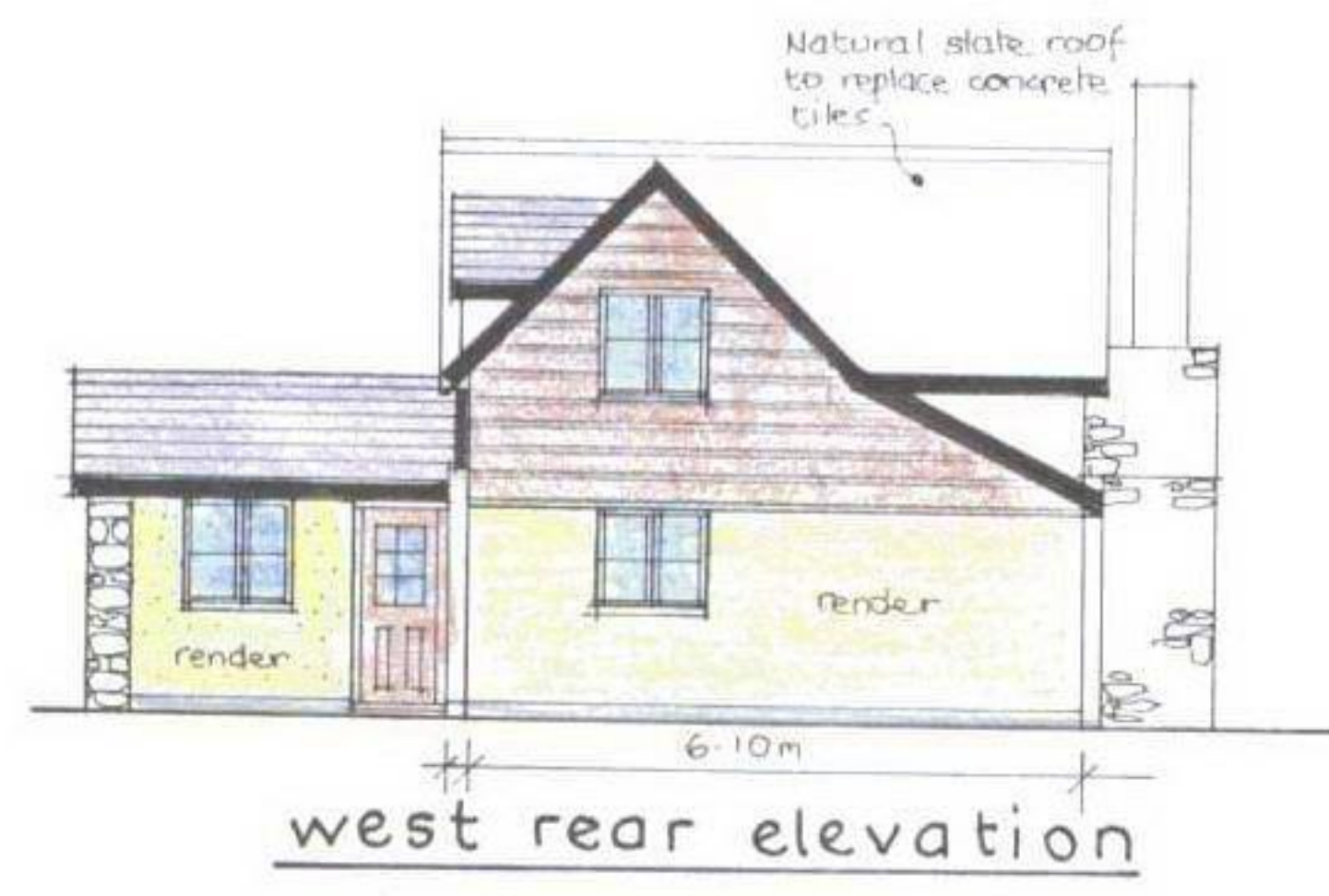
west rear elevation