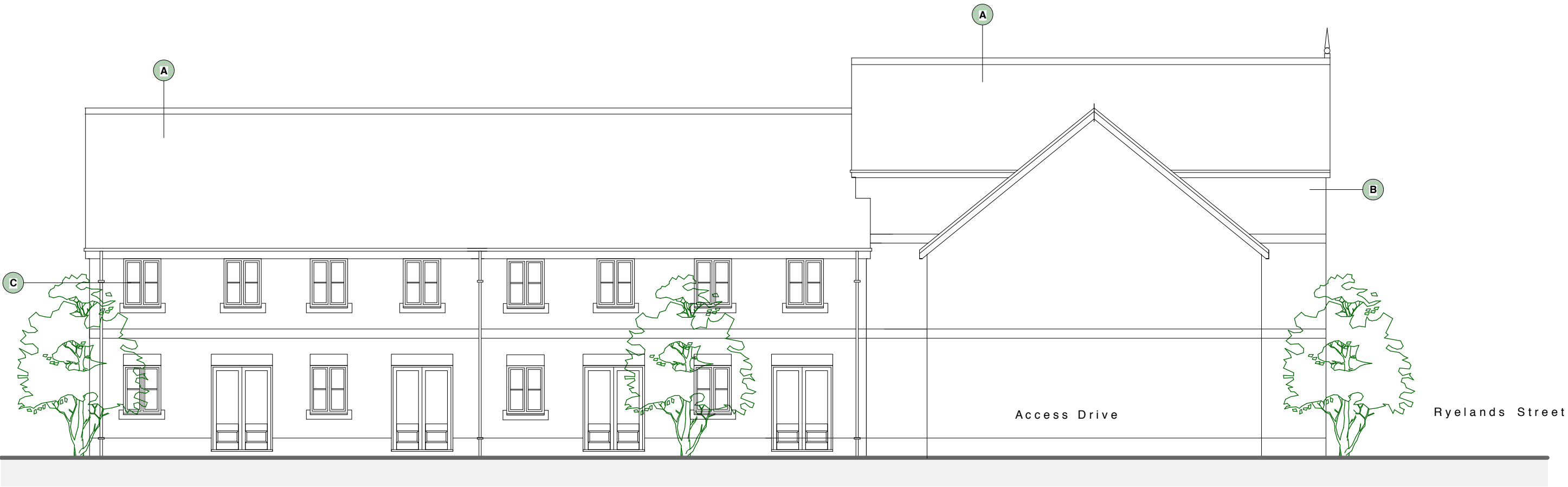
S o u t h W e s t e l e v a t i o n

Do not scale from this drawing all dimensions must be checked on site.