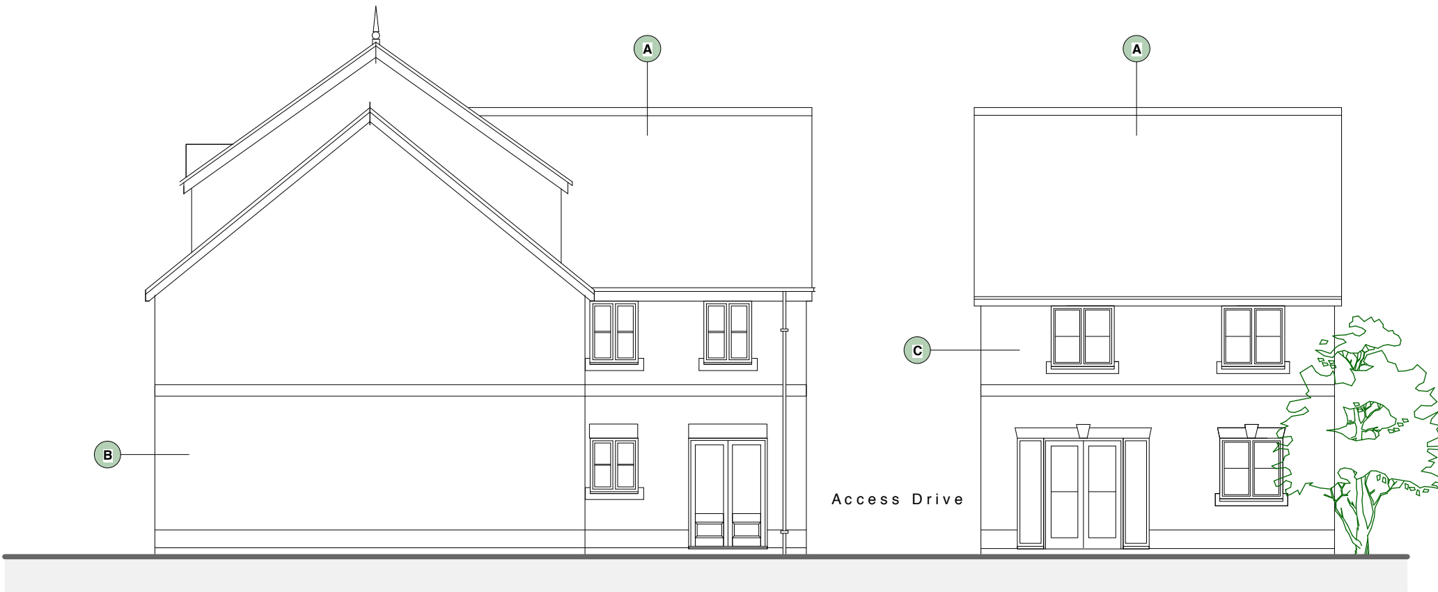
S o u t h E a s t e l e v a t i o n - T o R y l a n d s S t r e e t