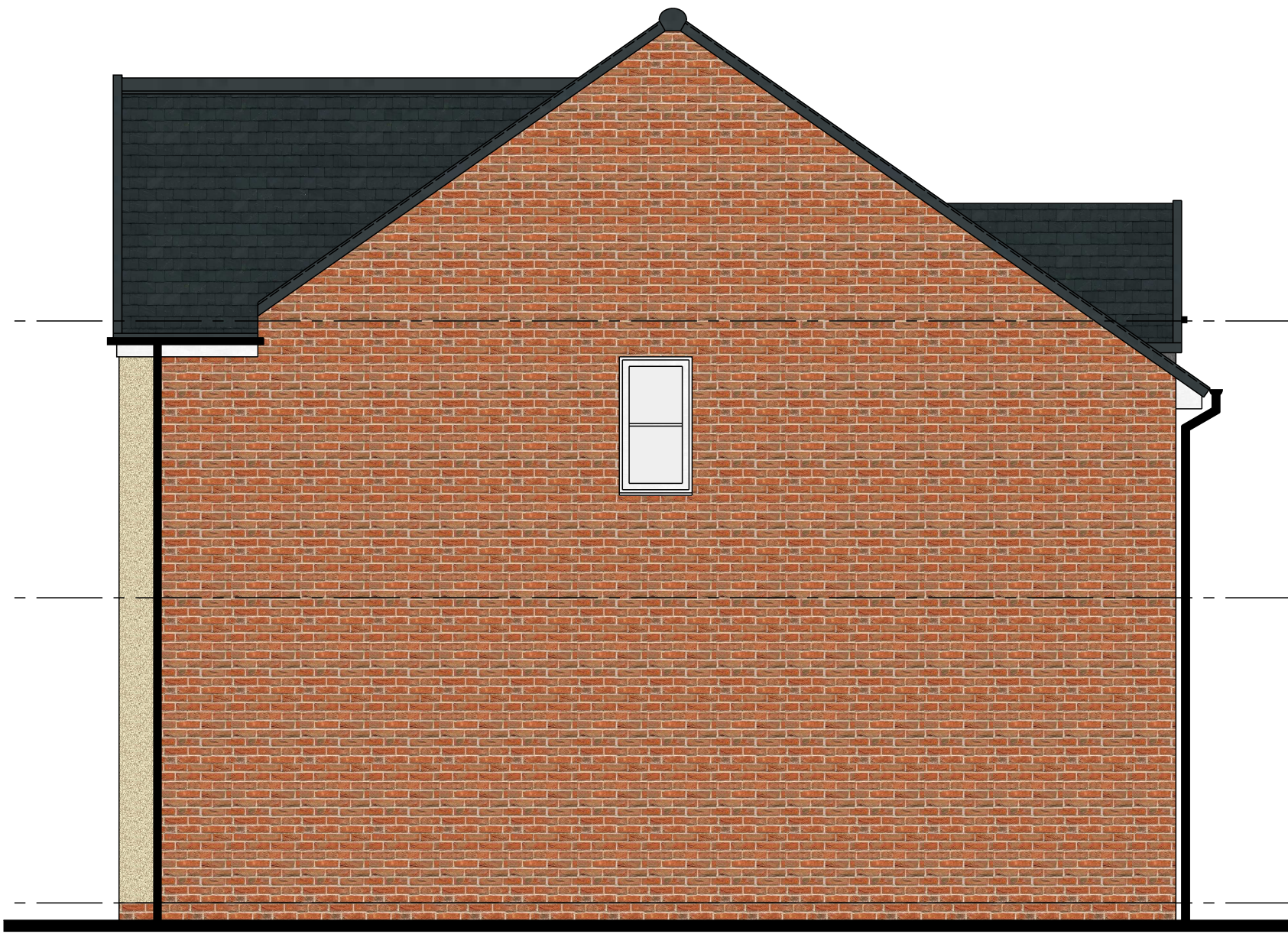
Side Elevation as Proposed - 1:50