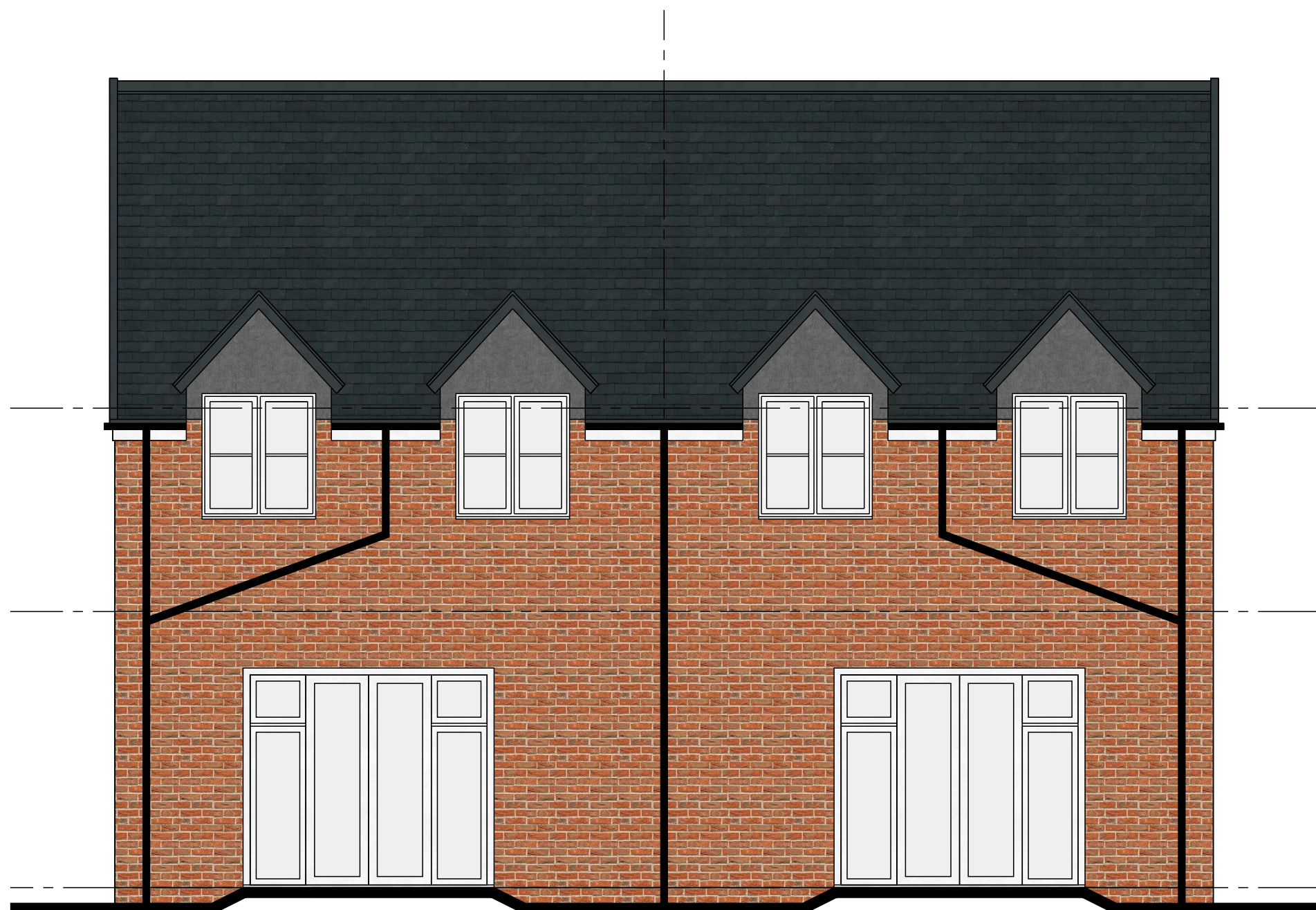
Rear Elevation as Proposed - 1:50