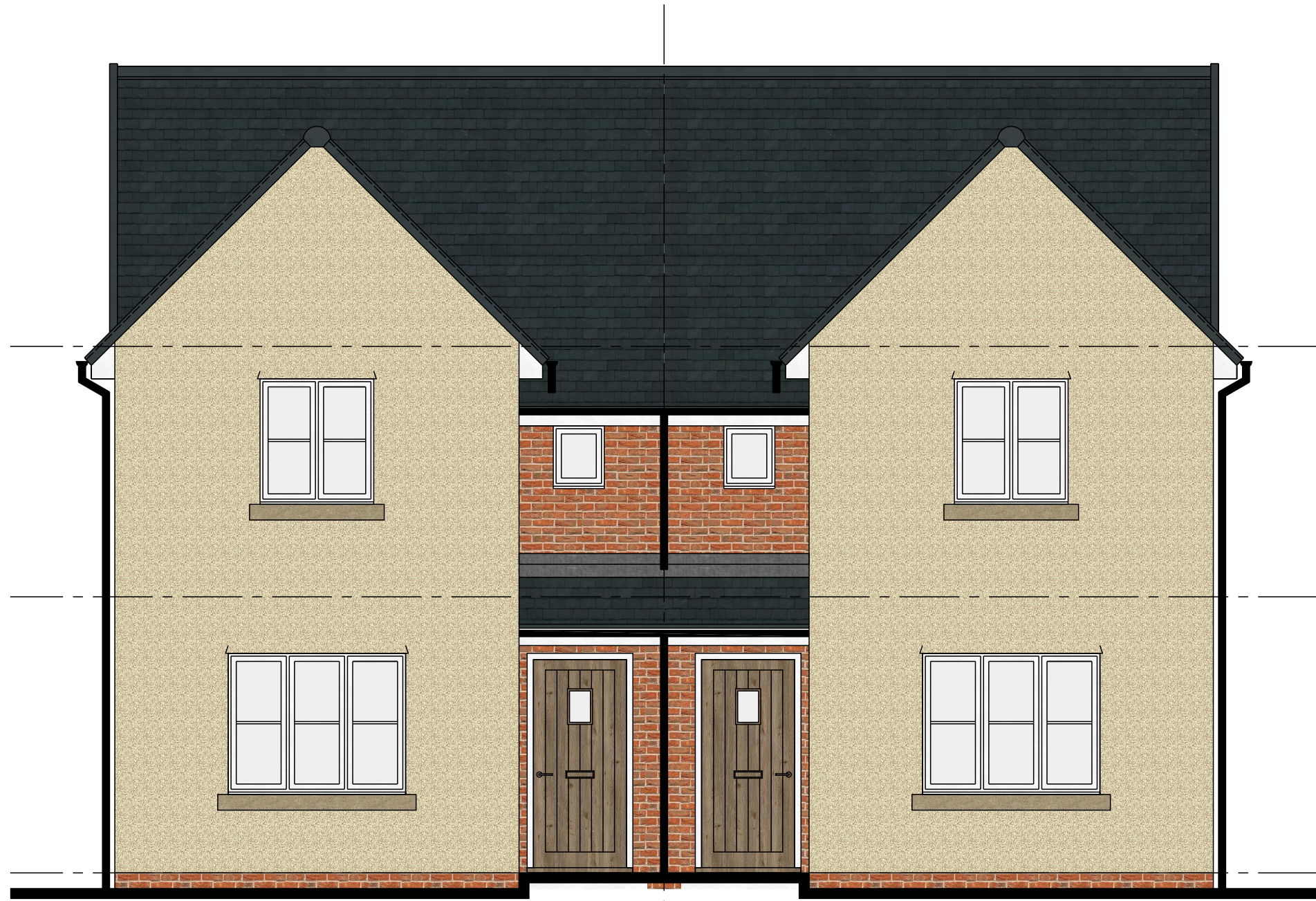
Front Elevation as Proposed - 1:50