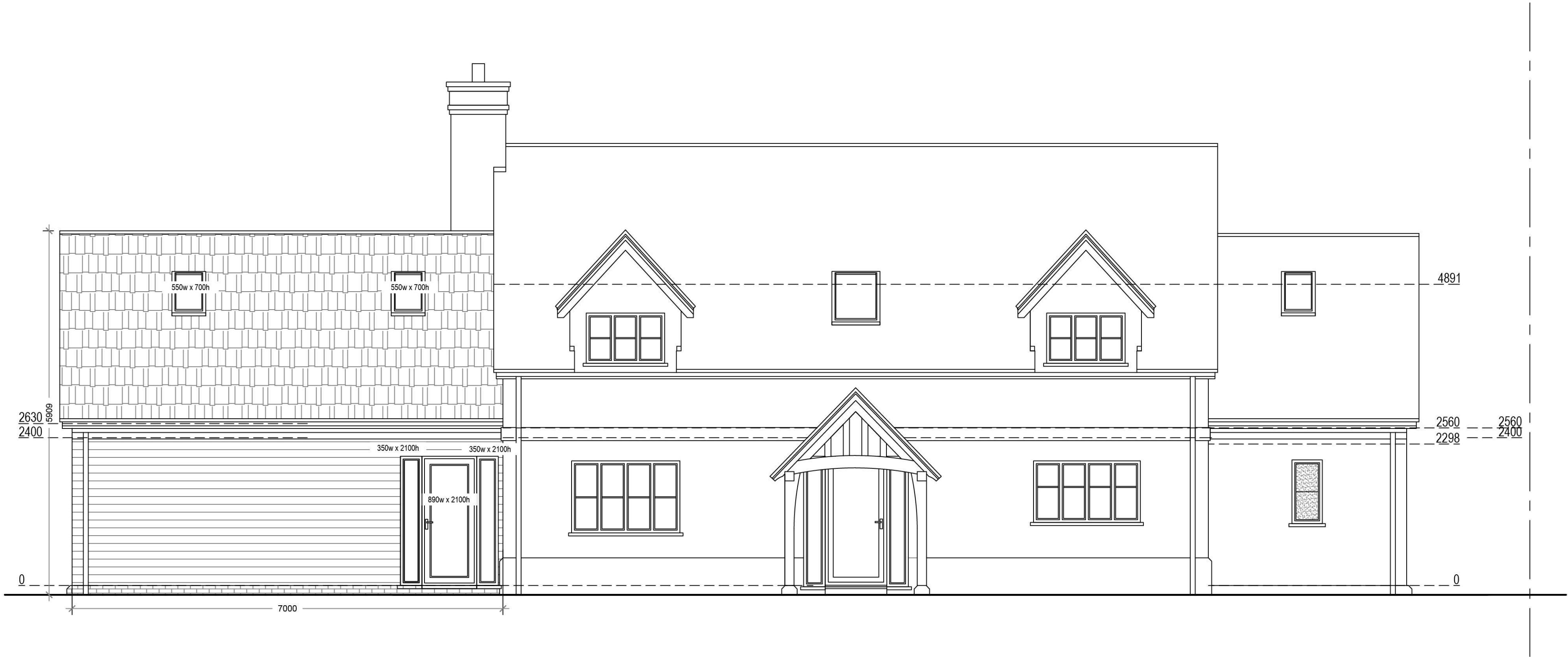
Proposed South Elevation Scale 1:50

Proposed Materials: Walls: Render (to match existing) Walls: Timber cladding (to match existing) Pitched roof: Tile (to match existing)