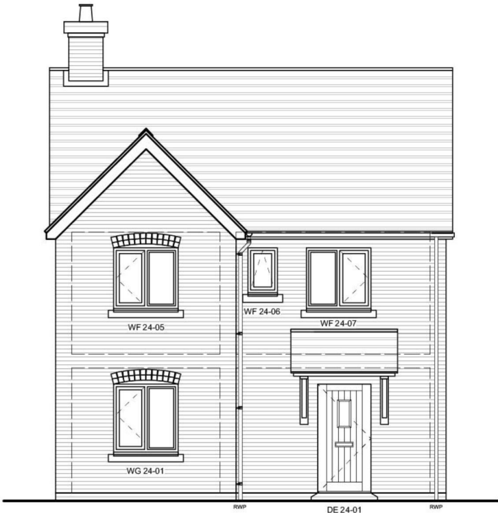
Plot 24 - Joyce Front Elevation

-: 20.02.17 - LW - RJF: Drawing created. Rev A: 17.08.17 - LW: Amendments to drawing following comments received from Shelley on 17.08.17. Rev B: 30.05.17 - LW: Amendments to materials following SE at MFF comments received 30.05.18.