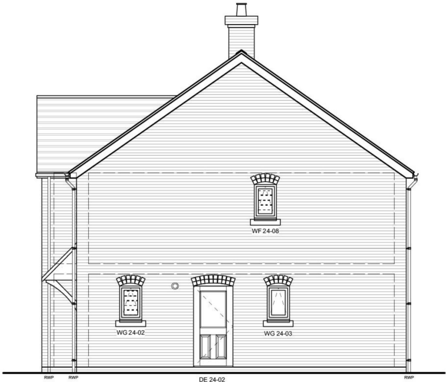
Plot 24 - Joyce Side Elevation