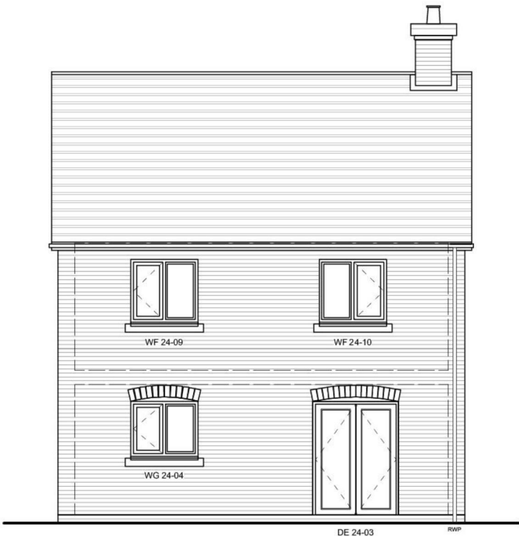
Plot 24 - Joyce Rear Elevation