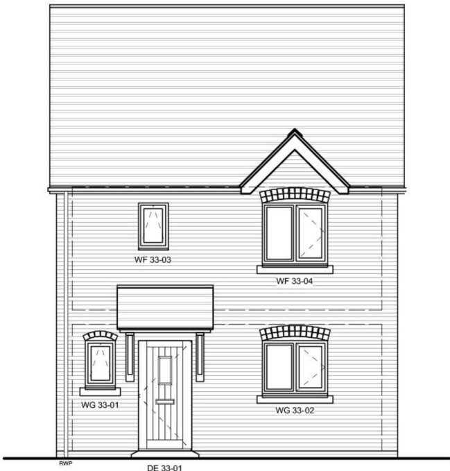
Plot 33 - Hardy Front Elevation

~: 20.02.17 - LW - RJF: Drawing created. Rev A: 17.08.17 - LW: Amendments to drawing following comments received from Shelley on 17.08.17. Rev B: 30.05.17 - LW: Amendments to materials following SE at MFF comments received 30.05.18.