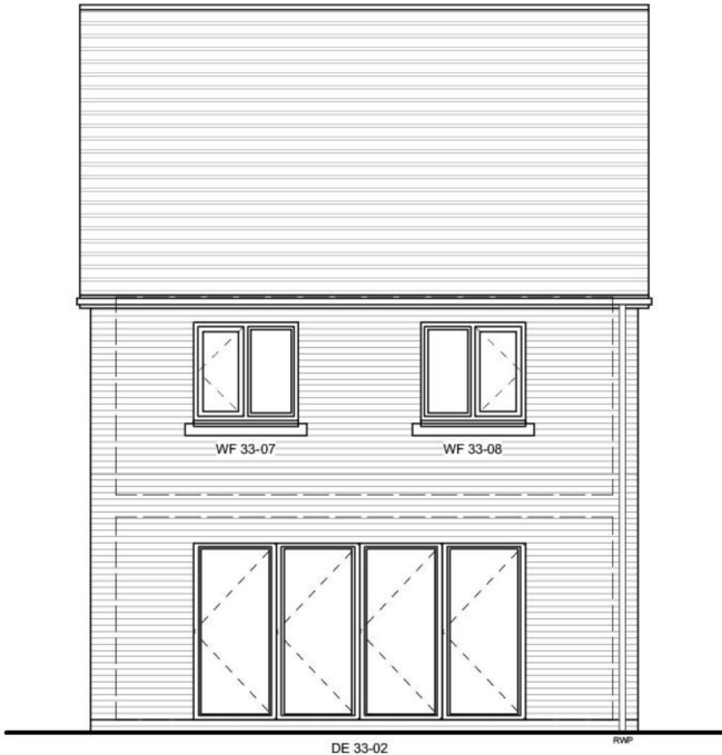
Plot 33 - Hardy Rear Elevation