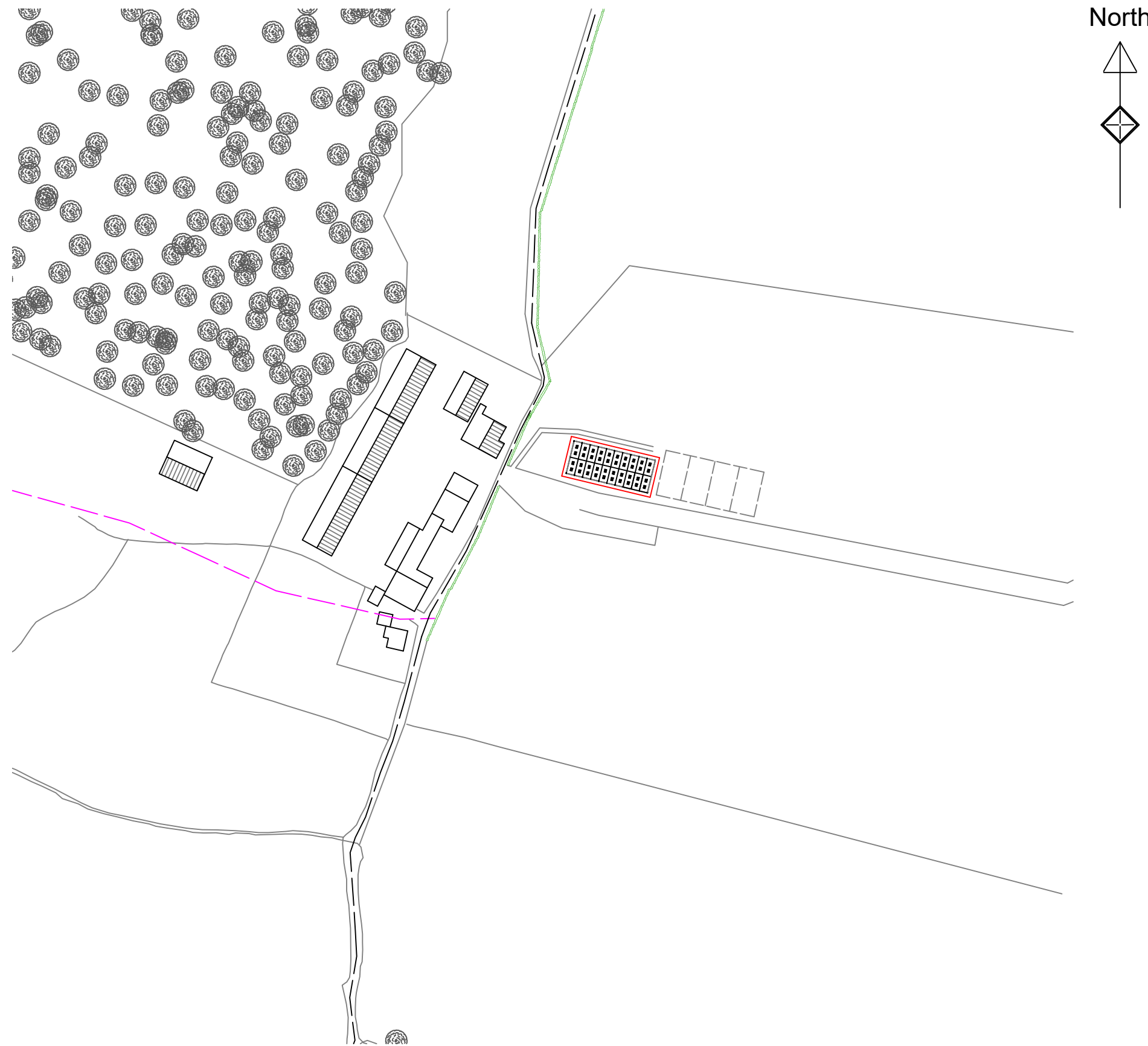
Location Plan 1/2500 Broken pink line denotes PROW.