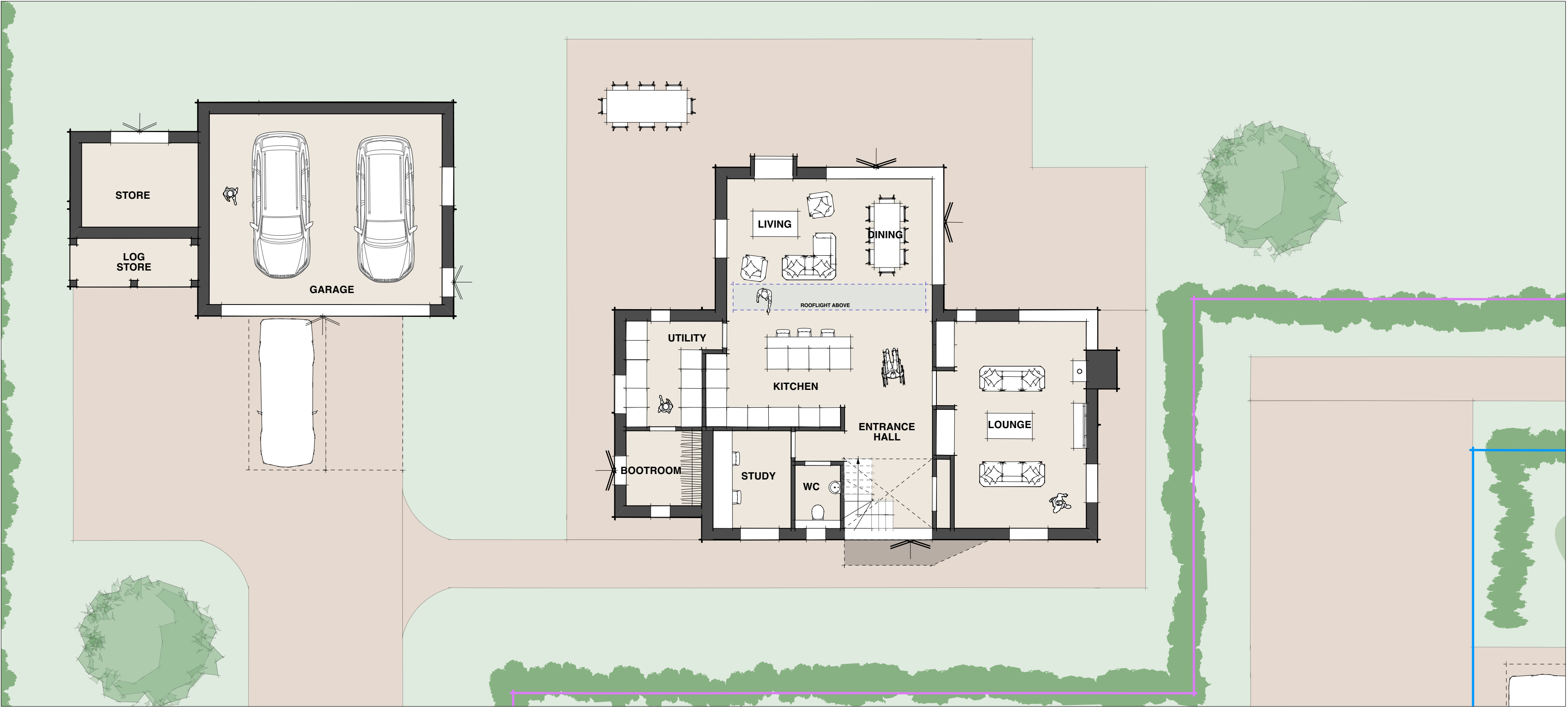
01 GROUND FLOOR PLAN Scale: 1:100 @ A1