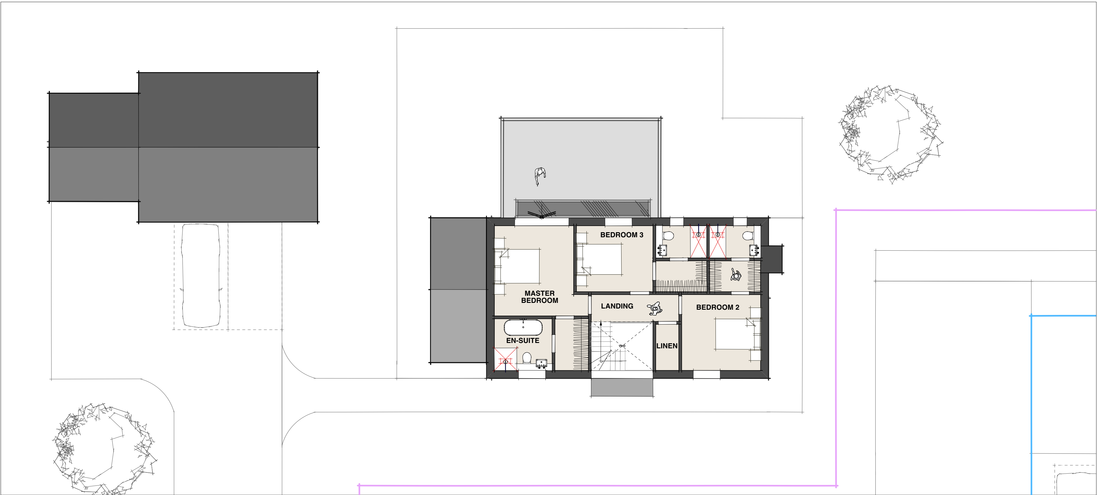
02 FIRST FLOOR PLAN Scale: 1:100 @ A1