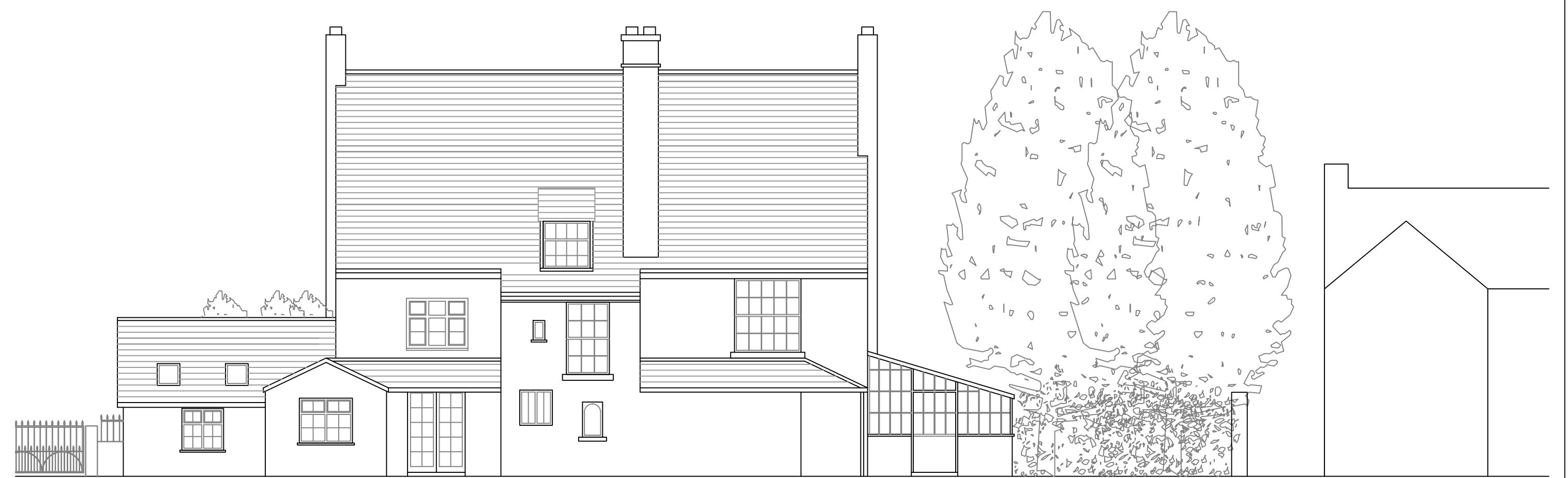
NORTH WEST ELEVATION 1:100