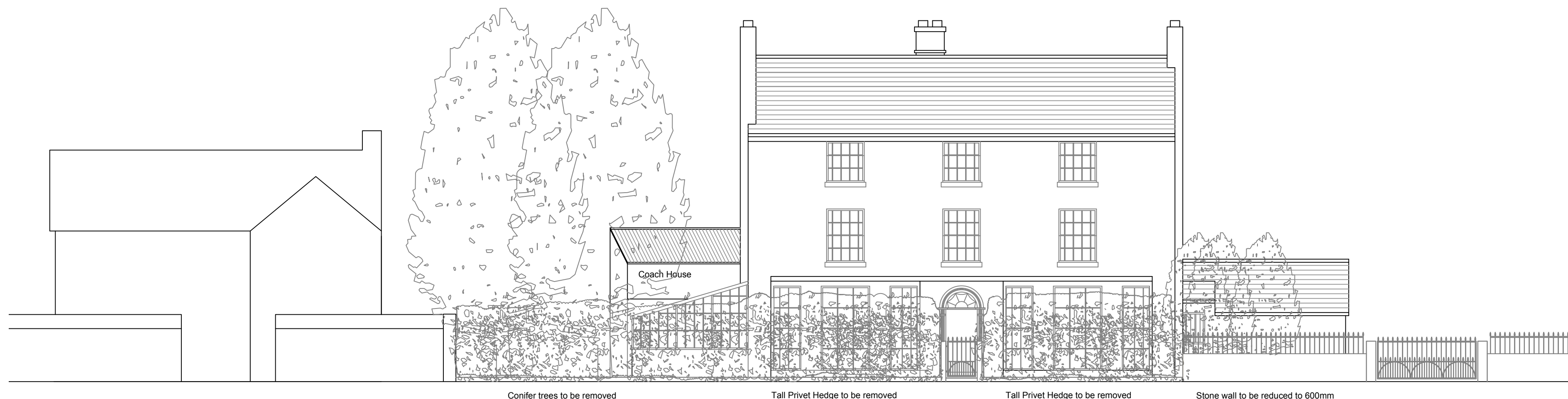
EXISTING STREET ELEVATION 1:100

Project: proposed residential development at Brookside, Whitchurch.