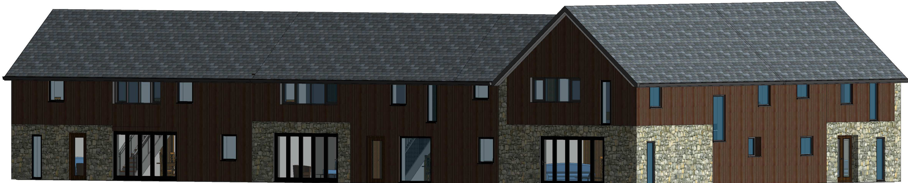
5 3D View 1