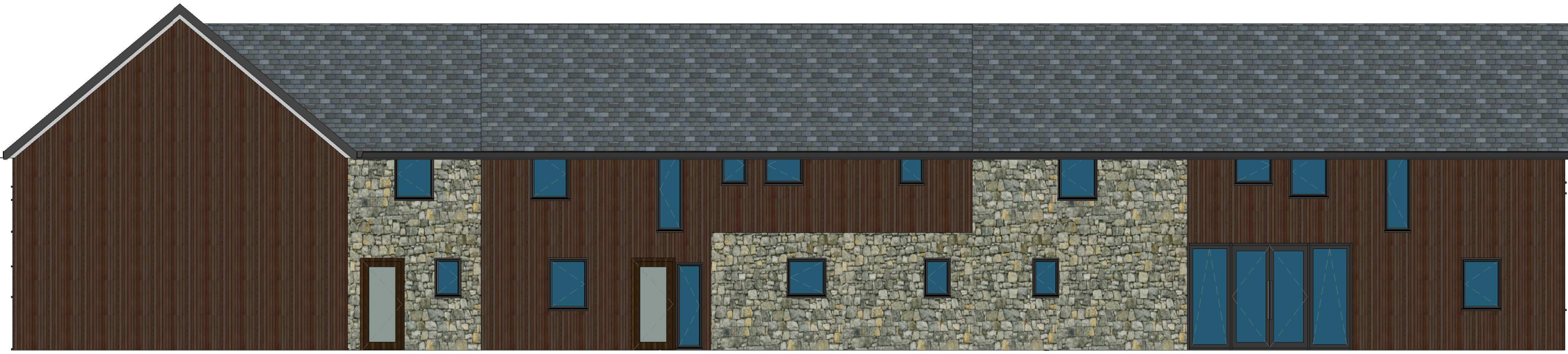
4 West Elevation 1 : 100