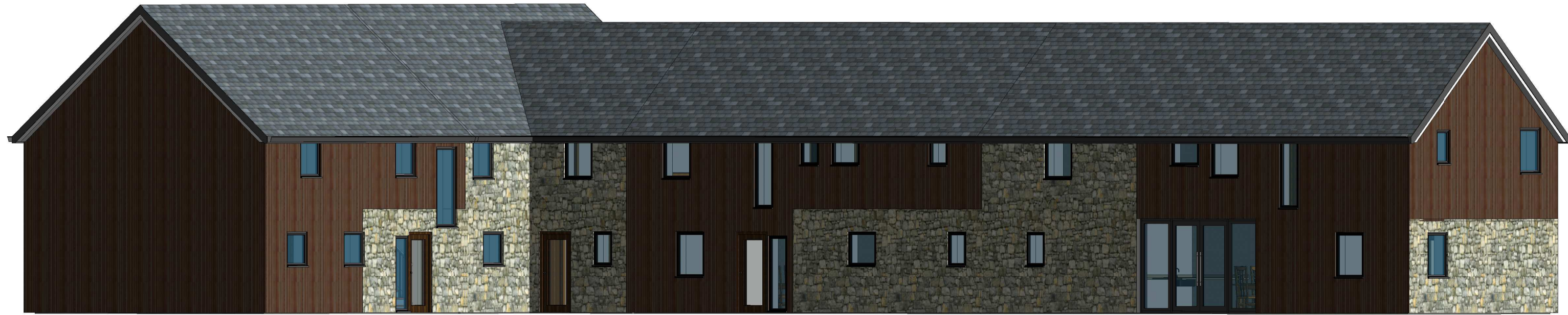
6 3D View 2