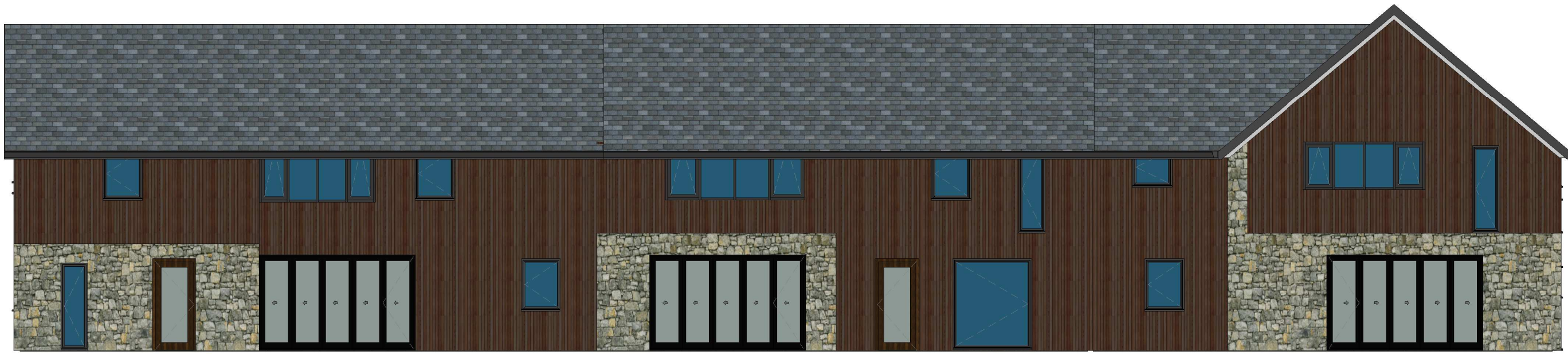
2 East Elevation 1 : 100