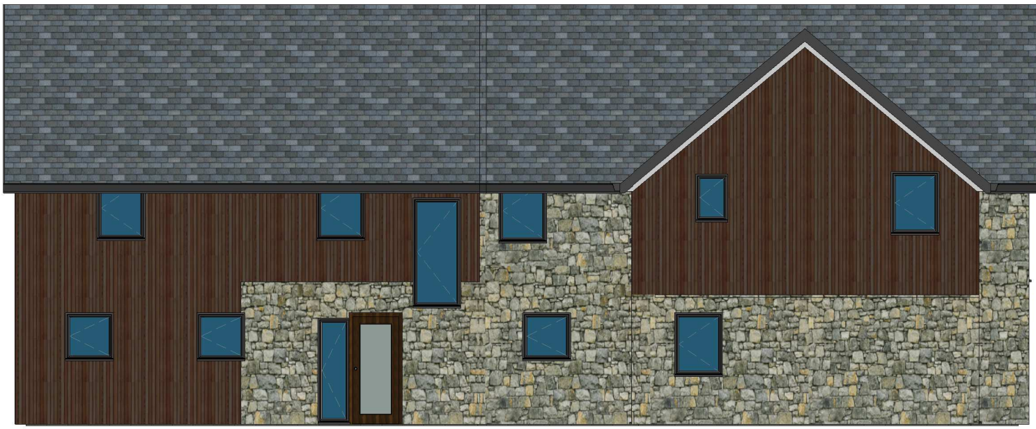
3 South Elevation 1 : 100