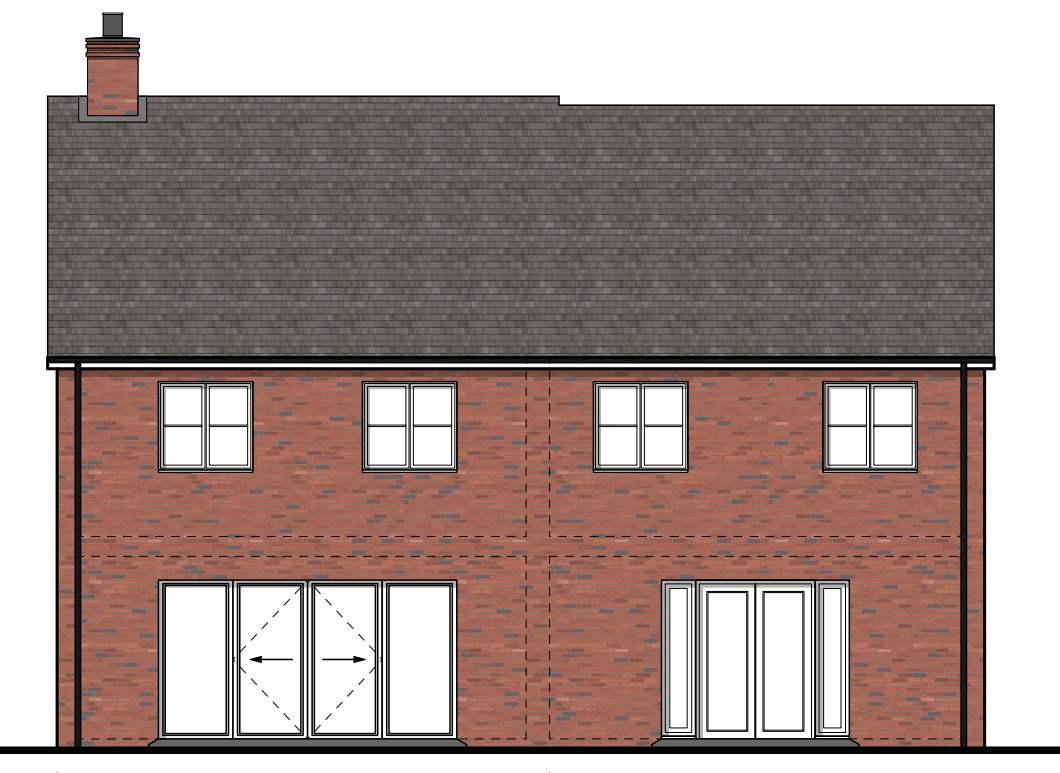
Plot 39 Rear Elevation