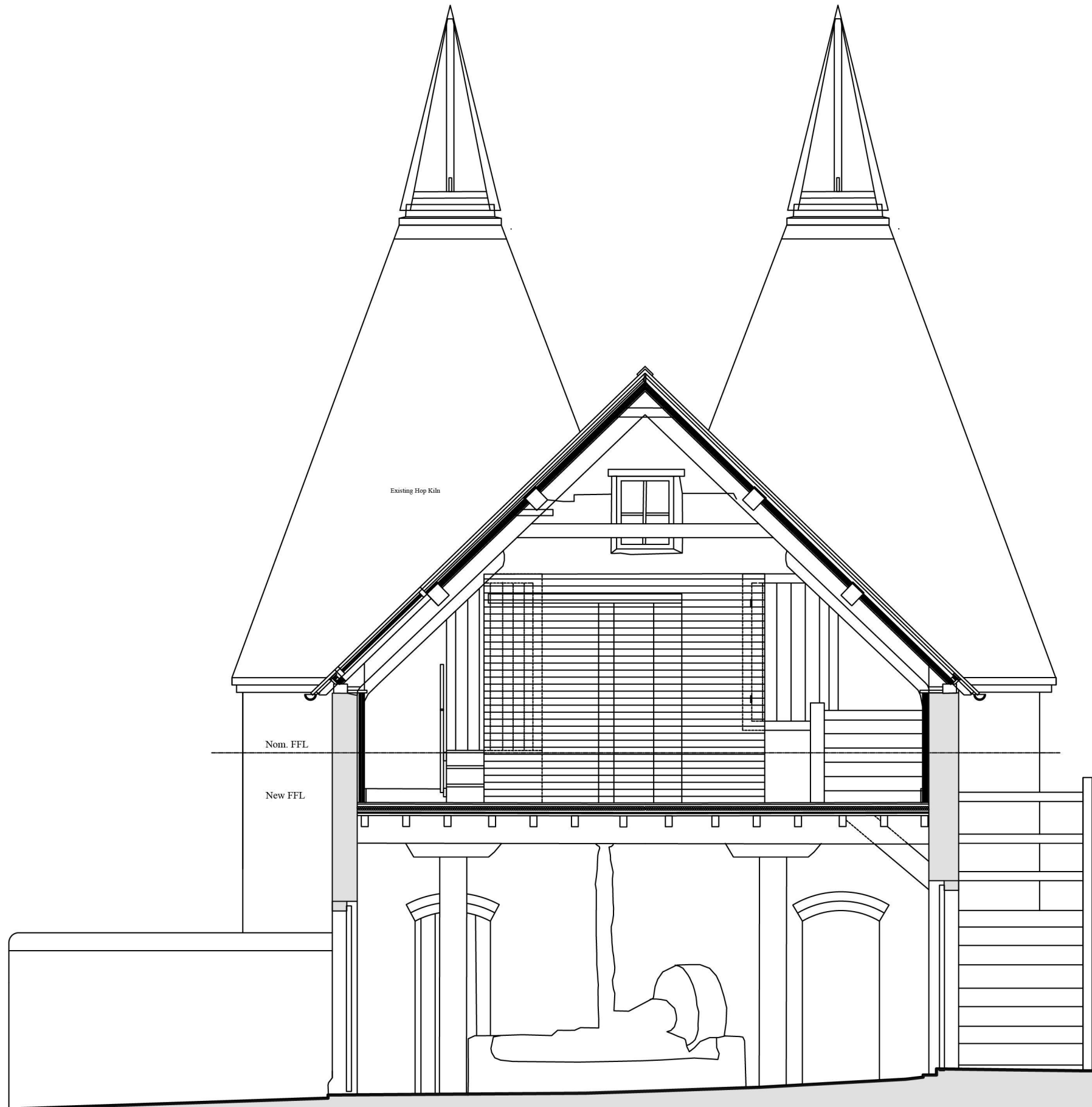
Proposed Section C-C