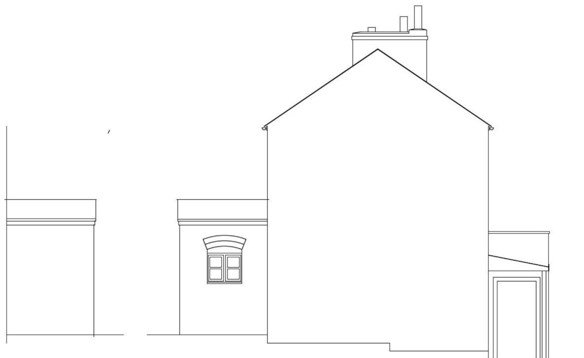
PROPOSED S E ELEVATION OF BATHROOM