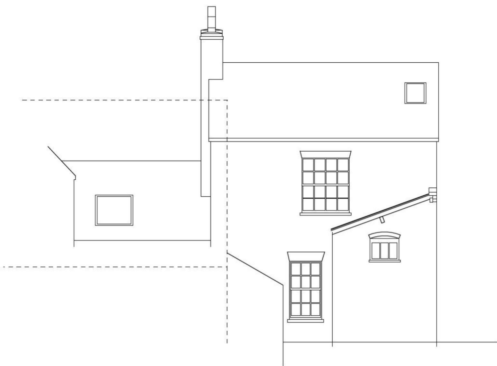
EXISTING N E ELEVATION WITH MONOPITCH ROOF TO BATHROOM