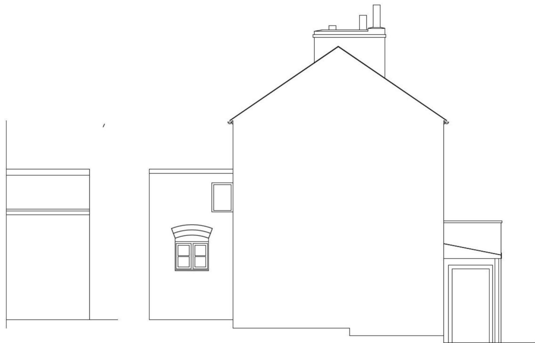
EXISTING S E ELEVATION OF BATHROOM