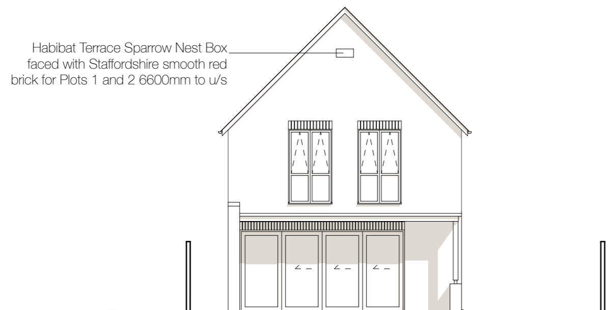
3. REAR ELEVATION