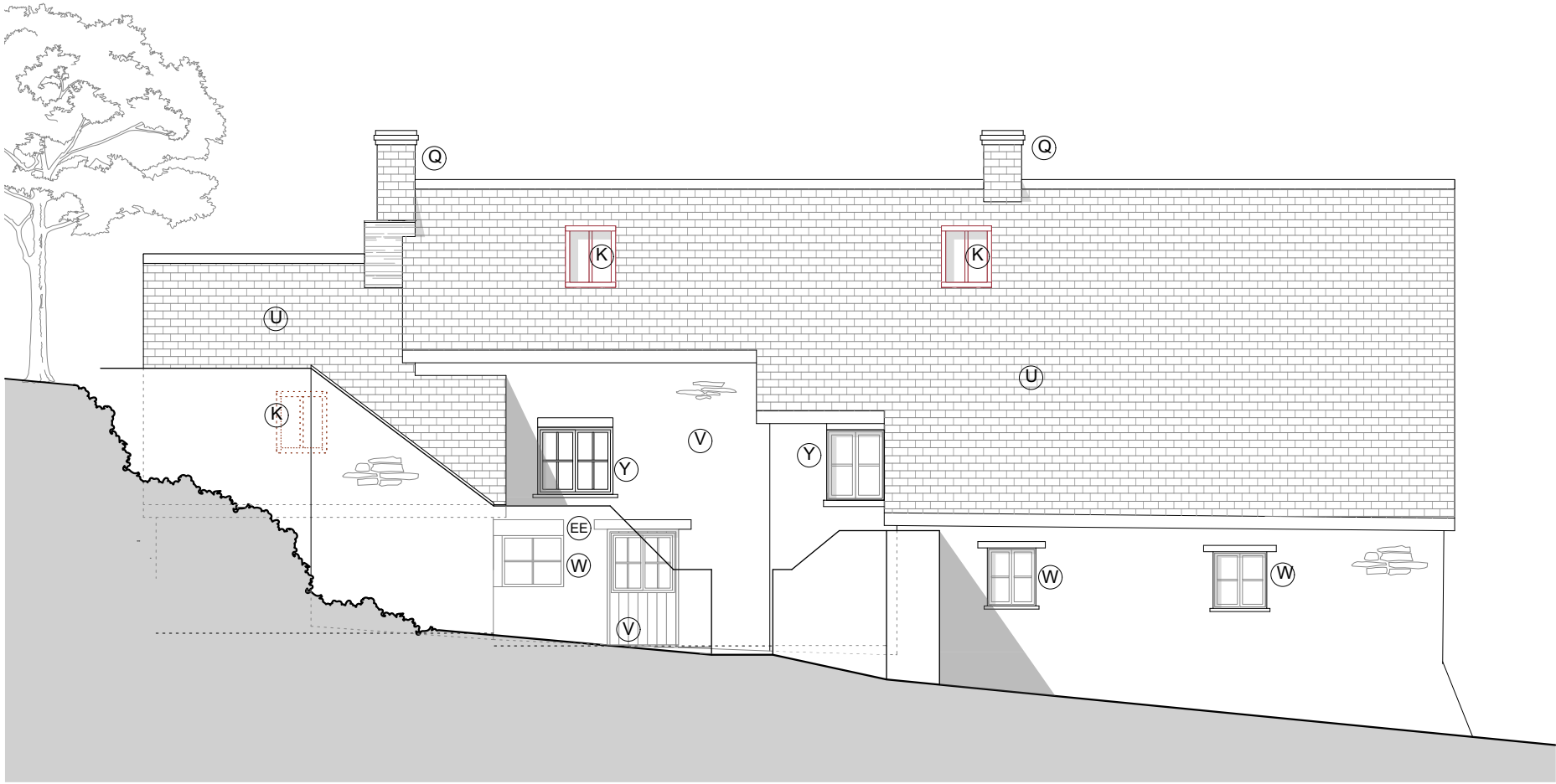
Scale bar 1:100