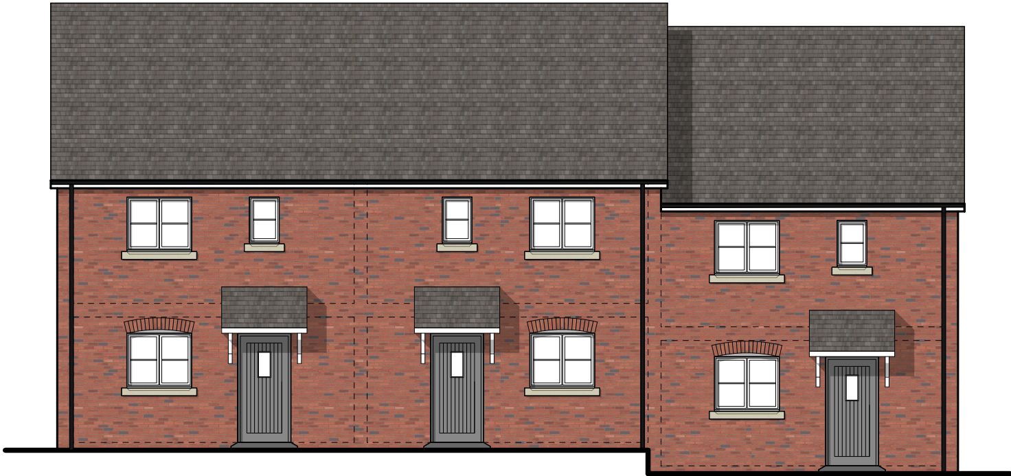
Plot 22 Front Elevation

-: 17.03.21 - DC: Drawing created. A: 12.04.21 - LM - BWWh: Key stones removed. Side elevations amended. Materials key amended. Eave height amended. FF windows amended. B: 04.05.21 - BWWh - RJF: Front elevation windows amended. C: 17.05.21 - BWWh - RJF: Scale bar added.