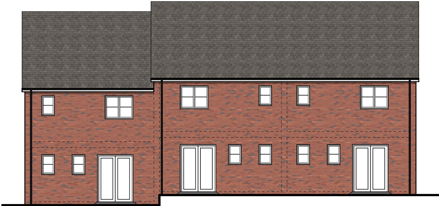
Plot 24 Rear Elevation