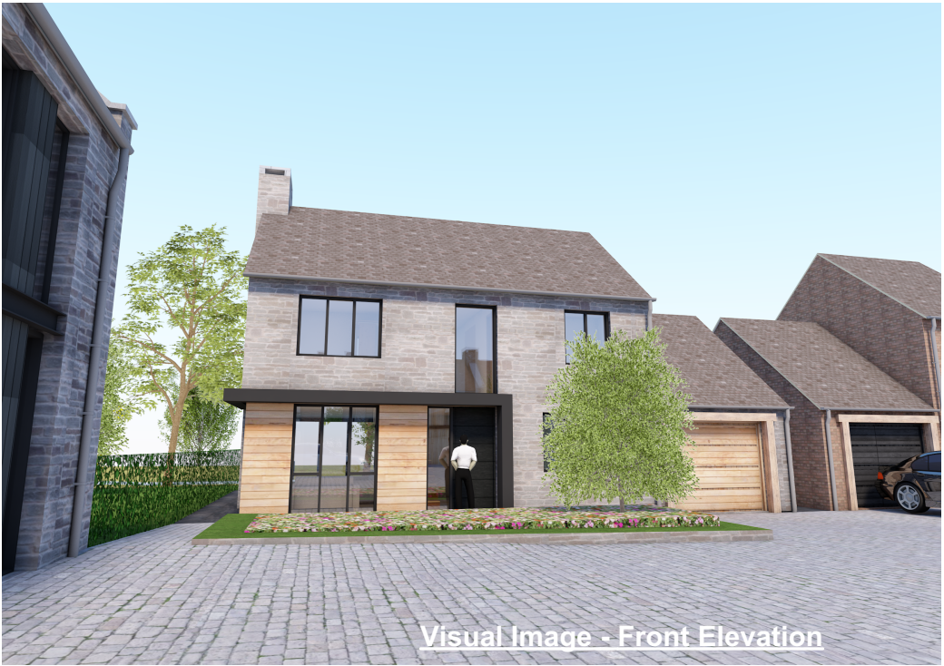
Visual Image - Front Elevation