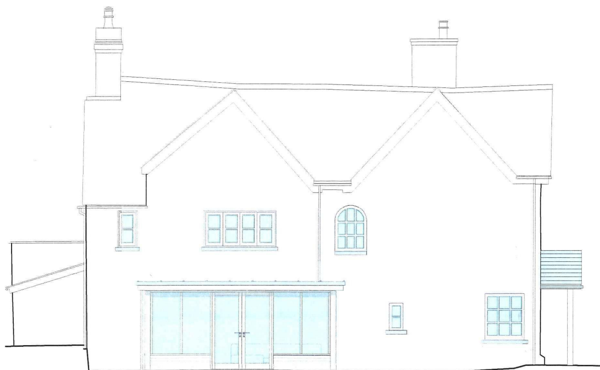
3 SOUTH ELEVATION SCALE - 1:100