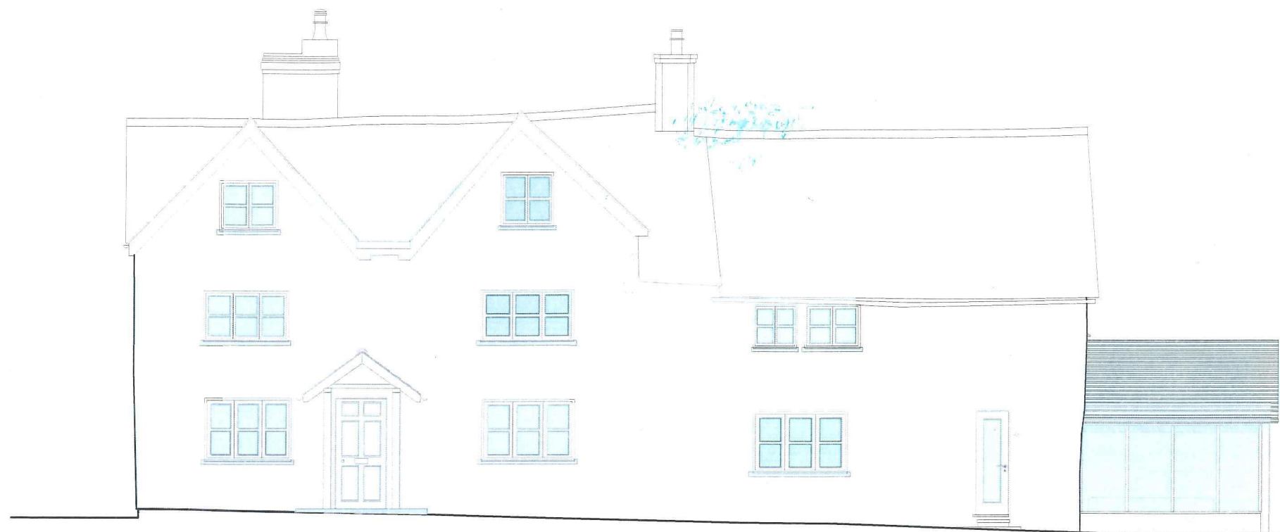
2 EAST ELEVATION SCALE - 1:100