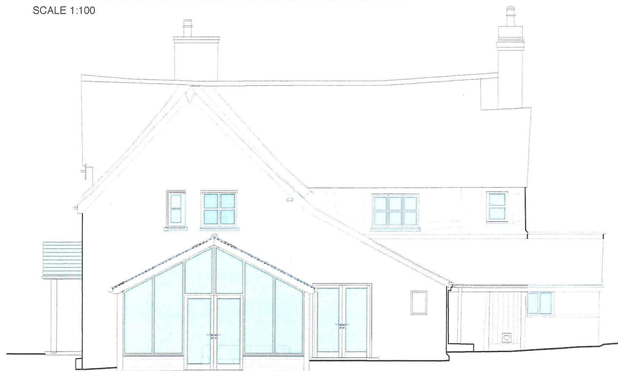
1 NORTH ELEVATION SCALE - 1:100