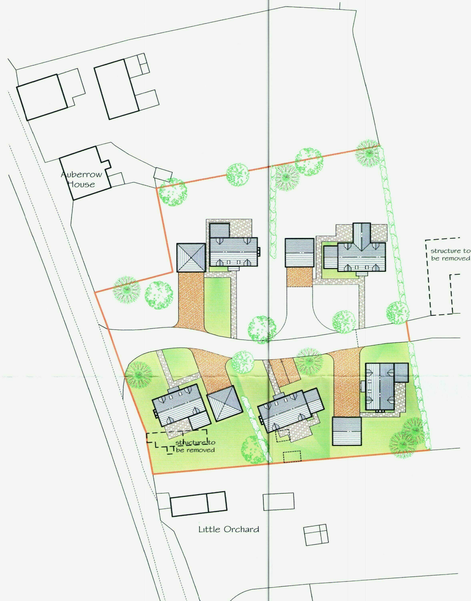
Block Plan (1:500) (indicative layout only)